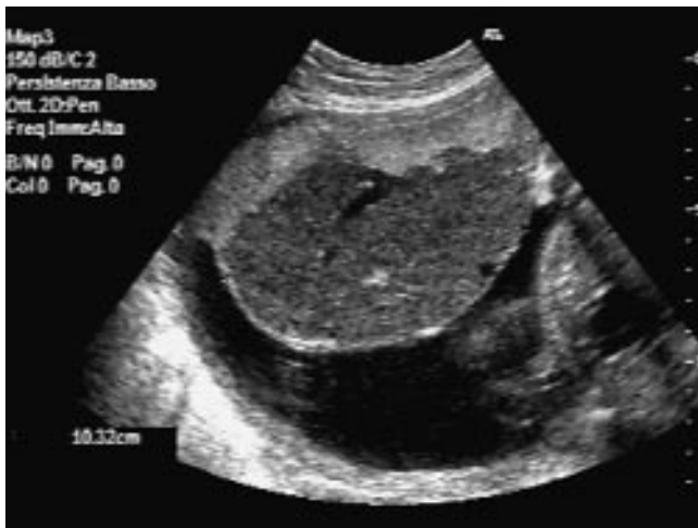
Fig. 1. Ultrasound scan showed a large mass behind the placenta, with echo-free areas of a probably vascular nature.

The placenta weighed 650 g and measured 15 × 12 × 2.5 cm. The umbilical cord segment measured 25 cm in length and ranged between 1.5 and 2.5 cm in diameter; it showed a large mass near to its placental end, weighing 600 g and measuring 13 × 12 × 7 cm (Fig. 2). The sur-