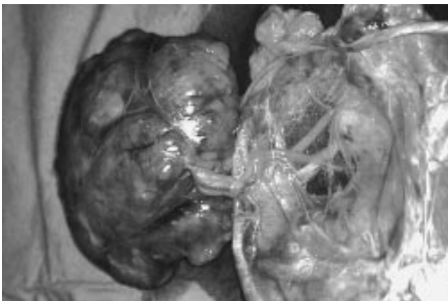
Fig. 2. Macroscopic examination revealed a large ovoid mass near the placental end.

face was smooth and pale, with hemorrhagic areas and gelatinous appearance. A 3 cm long segment of normal cord was present between the lesion and the placental cord insertion.