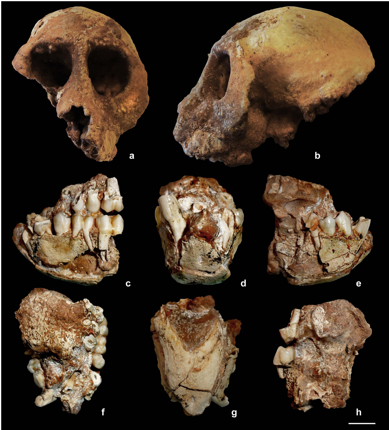
Fig. 2 - Macaca majori Azzaroli, 1946 remains from Is Orieris: (a-b) incomplete cranium MDLCA 14012 in (a) frontal and (b) left lateral views; (c-h) the new remain MPC 8116 in (c) left lateral, (d) anterior, (e) right lateral, (f) superior, (g) inferior and (h) posterior views. Scale bar corresponds to 1 cm.

additional vertebrate remains were found together with the specimens, and further field surveys aimed to discover further macaque remains were not successful.