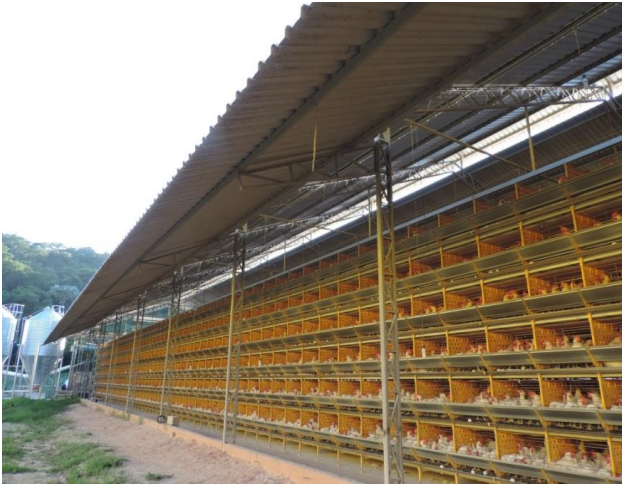
Figure 2: Vertical System

In vertical farming systems, measurements were performed on days corresponding to the first day after the removal of waste of laying hens shed, and on the day the mats would be triggered for new cleaning.