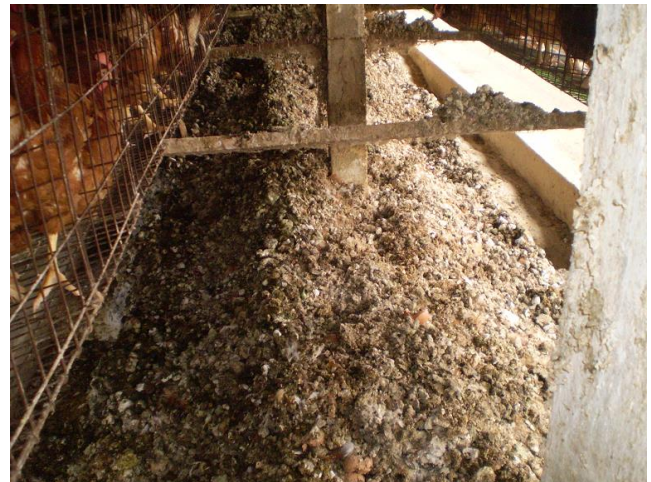
Figure 5: Manure stored