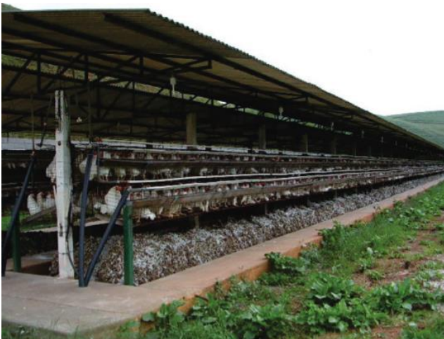
Figure 4: Conventional System

For this purpose, we used ammonia sensors inside the facility by measuring the concentration of NH 3 gas at the level of the animals. At the vertical system opted for the average height of battery cages (1.7 m), whereas in conventional system chosen height was the first row of cages (0.7 m).