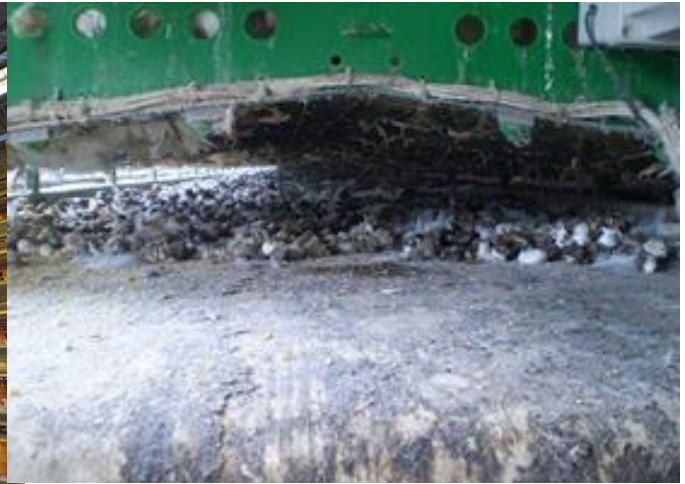
Figure 3: Manure belt

The manure was removed mechanically by means of mats positioned below each floor cages carting them towards the point "a" to point "and" where they are directed to another conveyor, which transports all waste out of installation for subsequent adequate treatment. As the ends of the aviary are closed and the movement of waste when they pass a treadmill to another, provides a release of gas, it was decided to measure the NH 3 concentration also in the waste transition area located at the end of the shed in point 3e, which is located near the electrical panel responsible for triggering the mats.