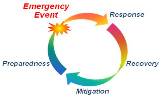
Figure 1: Phases of emergencies situations

The synergistic use of communication, positioning and global monitoring services, provided by means of meshed heterogeneous architectures based on satellite and terrestrial segments, resorting to the most recent cognitive, cooperative and context and location-aware technologies, with deterministic and opportunistic radio access, can afford remarkable gains in terms of effectiveness, speed of response and performance in all phases of emergency situation management.