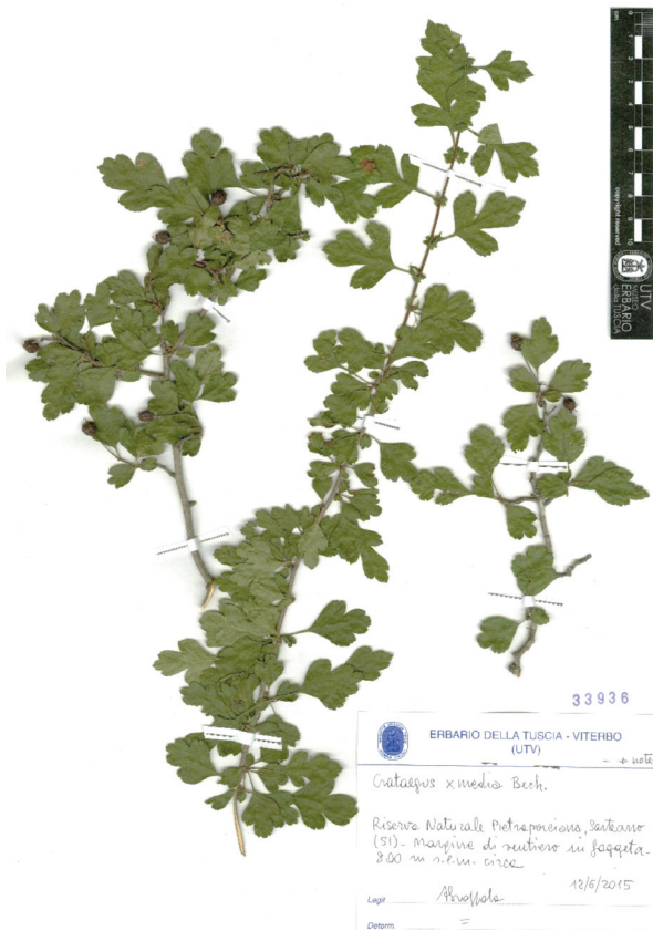
Fig. 2. Crataegus x media Bechst. new record for Tuscany. Specimen preserved in UTV (n. 33936).