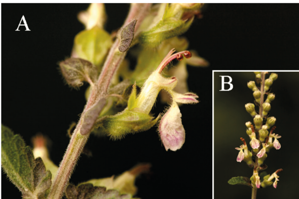
Fig. 3. Teucrium siculum (Raf.) Guss.: flower detail (A) and inflorescence (B).

cies, the natural value of Pietraporciana is highlighted also by the presence of only two alien species ( Artemisia verlotiorum and Robinia pseudoacacia ). From a conservation point of view 36 taxa resulted interesting (Tab. 2): 24 are afforded protection in Regional Law 56/2000, 3 are listed in the Regional Red Lists plants of Italy (Conti et al. , 1997), 2 are listed under the Naturalistic Tuscan Repertoire (Spisimo & Castelli, 2005;