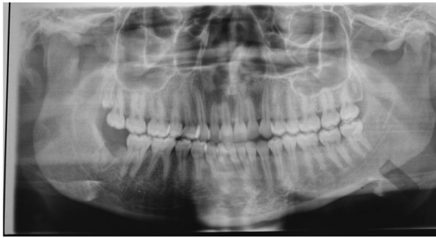
Fig. 4. Postoperative orthopantomography (OPG) scan which shows the correction of the temporomandibular joint ankylosis (TMJa) at 6 months after the surgical treatment.

groups of patients was performed by the Wilcoxon rank-sum test for continuous variables and Pearson Chi-square test (or Fisher exact test when appropriate) for categorical variables. Statistical analyses were performed using STATA (Stata Corporation, College Station, TX, USA). A 2-tailed p-value less than 0.05 was considered statistically significant.