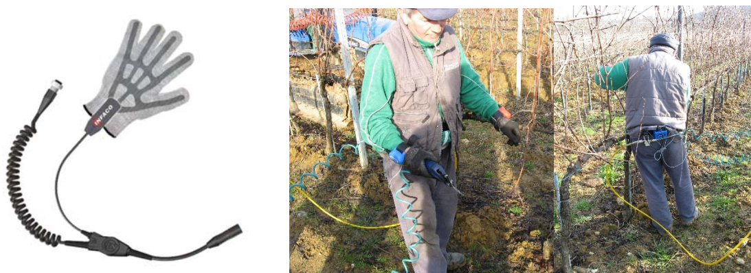
Figure 1: (Left) Active protection system based on conductive glove by Infaco (Bois de Roziès, France) company. (Right) Active electronic control systems for stopping tools based on remote detection via electromagnetic waves made Paterlini company (San Martino in Rio, RE, Italy).

In the first case, they are represented in gloves of metallic mail, which can be heavy and not properly comfortable to use but above all, they prevent from stub wounds but not to the shearing. The available active solution include electronic control systems for stopping tools.