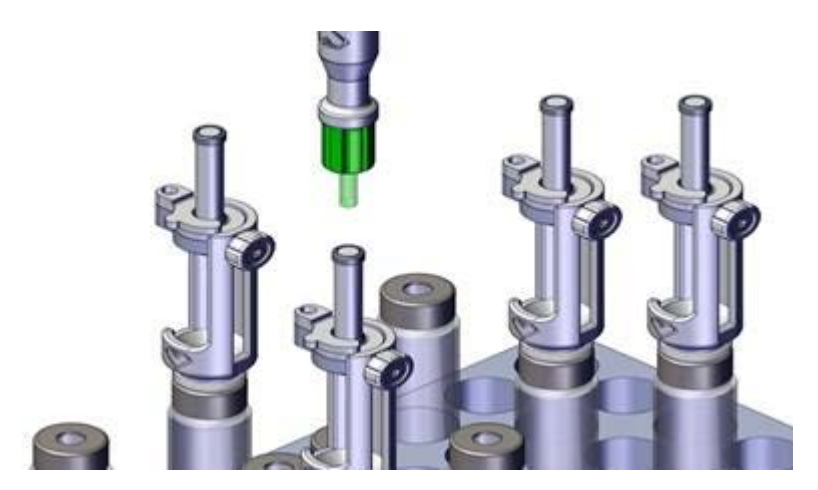
Figure 5. SPME 32-position Multi Off-Line Sampler

system and analysis time of 20 minutes. The results are excellent, with reduction of the total analysis time of 725 minutes (30 samples processed) respect to conventional SPME on-line analysis.