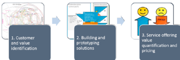
Figure 1. Three-step framework for developing and pricing valuable services

The internal interviews involved different company departments and provided insight about pains and gains of the customers, price sensitivity and where possible economics such as estimated costs, customer and business information and competitive pressures around the provision of both planned and unplanned services from the internal perspective. The results of the external interviews provided details of the objective of pricing and the strategies applied to obtain the objectives and tools subsequently used to support the achievement of the objectives. Customer surveys provided insight about pains and gains of the customers, price sensitivity and where possible economics from the customer perspective. Using the results of the use cases workshops and integrating these with the best practices identified in the literature, interviews and surveys, the authors have designed a process to assist industrial firms to understand better and improve the design and pricing of service offerings based on value that the customer are expecting. The proposed framework for designing and pricing services is shown in Figure 1. It provides a model for building a modular value proposition for services and pricing the offering according to customer value.