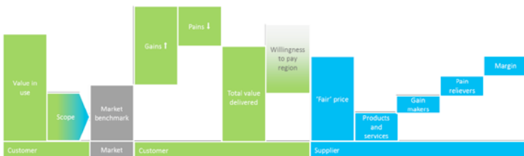
Figure 3. Value-based pricing framework