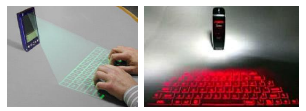
Figure 3. DOE Diffractive effects examples - DEIS Department University of Bologna (Italy)