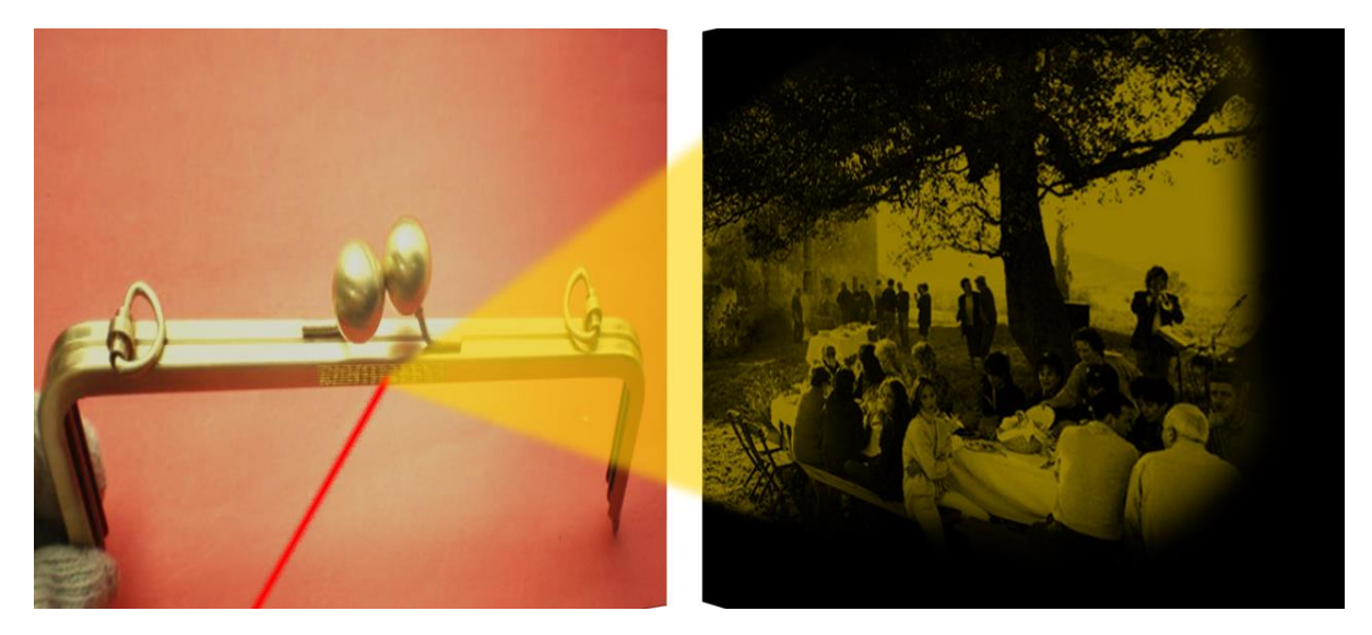
Figure 4. Dffractive effect by reflection due of an external laser sourse – application on a metal component of fashion accessory – REIlab DIDA Department University of Florence