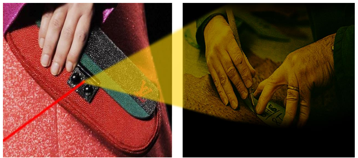
Figure 3. Dffractive effect by reflection due of an external laser sourse – application on a metal component of fashion accessory – REIIab DIDA Department University of Florence

diffractive methods could highlight the intrinsic attitude of SMEs in technology transfer and crass fertilization applications.