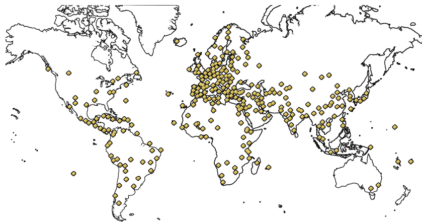
Figure 1: Imbalanced distribution of cultural World Heritage sites based on continents and countries (UNESCO, 2016).

Western culture in defining historical buildings, churches and archaeological sites of great global significance (Steiner & Frey, 2011). It is argued that each region has its own historical and philosophical perspectives towards authenticity, spirituality and historical significance, and that cultural-specific ways of reading or valuing cultural heritage should be recognized (Winter, 2014). However, this argument is set forward based on case studies with limited scope. Most studies focus on single governmental levels, short time periods, single locations and/or disciplines, while making global claims (Rodgers & Grigolon, 2015). UNESCO is working to correct this imbalance and in its 2016 guidelines, the priority has been given to inscribe the areas located in the states that have not had any World Heritage sites (World Heritage Committee, 2016). However, Cuccia (2012) states that the approach adopted by UNESCO cannot be correct; because the expansion of the World Heritage List reduces UNESCO's ability to protect the World Heritage. She also states that a larger list will reduce the importance of inscription based on the values of historical and artistic on the one hand, and reduces the economic impact on the area on the other. She concludes that if UNESCO covers a large number of sites, it will become unable to play an effective role in overseeing protective and valuation programs.