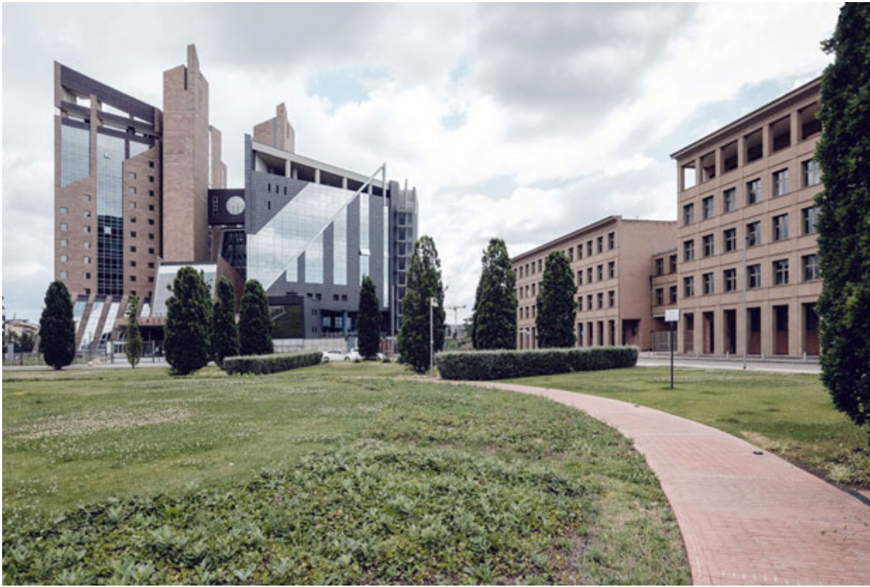
↑ Palazzo di Giustizia of Florence: project 1988; built posthumously 2000-2012.

TAG Florence | housing | religious buildings | villas