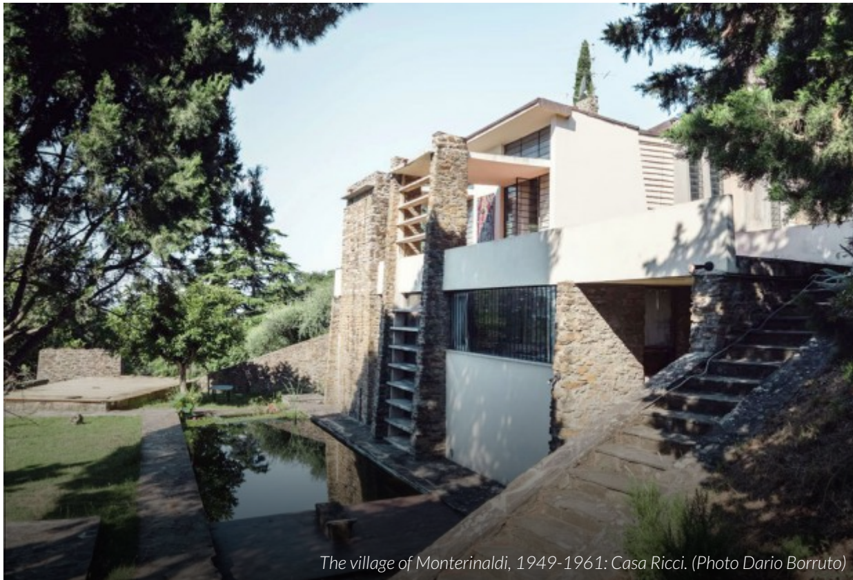
The village of Monterinaldi, 1949-1961: Casa Ricci.

Abitare > Architecture > Projects > Happy birthday Leonardo (Ricci)