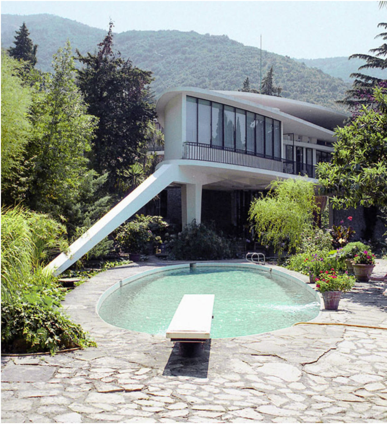
↑ Villa Balmain, 1958.