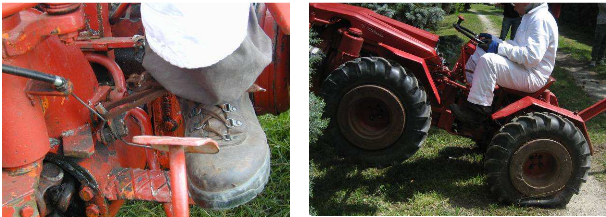
Figure 5. 4WD small tractor: typical case of capture (see the shoelace) and case of tractor rear up pulling something.

The program of these meetings is organized as follows: accidents analysis in agriculture with particular attention to Tuscany activities, risk cases analysis, controls and procedure to mitigate risks in agricultural activities, legislative approach, norms, responsibilities and actors.