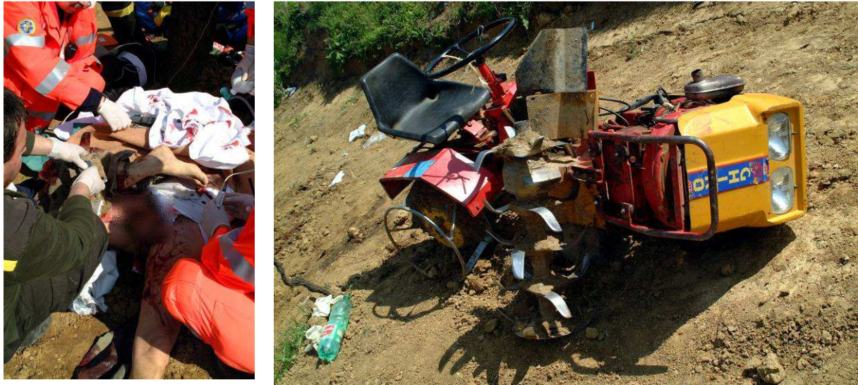
Figure 6. Motor hoe tractors provoke usually heavy and permanent injuries.

Dealers of agricultural equipment have great responsibility in training operators for safe use of machinery for their opportunity to meet frequently the farmers.