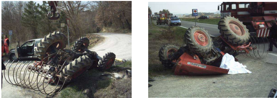
Figure 2. Old tractor without ROPS ( Rollover Protective Structure ) are cause of mortal accident. Inefficient brake system and lack of assisted-aid systems characterize these machines.