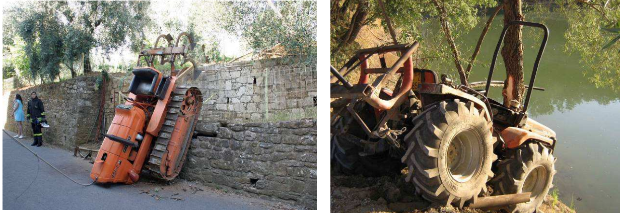
Figure 4. Oversights could have funny results but at the same time very dangerous.

The use of chain saws has been examined too.