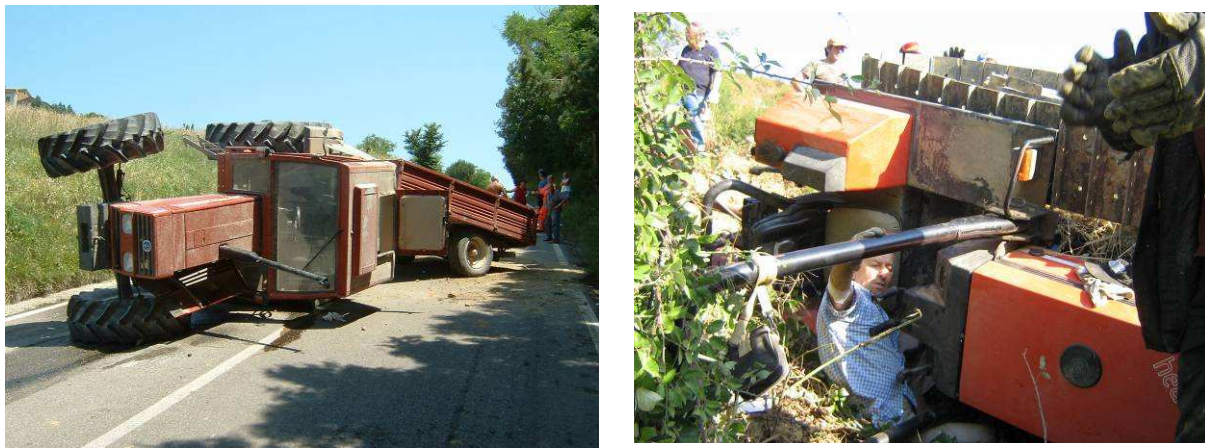
Figure 3. Accidents with conformed tractors equipped with ROPS and retention belt don't have heavy injuries for operators in almost all cases.

Many video clips have been produced in which are shown typical cases of risks in the use of unconformable and old agricultural machinery.