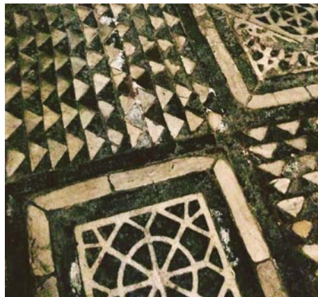
Fig. 1 - Detail of Baptistery floor, showing green (serpentinite) and white (marble) elements

The San Giovanni Baptistery is an outstanding worldwide monument, representing the oldest religious monument in Florence (Italy). Due to the lack of primary sources and specific dating issues, the Baptistery origins have been debated for a long time and are still controversial: different hypotheses, covering seven centuries, have succeeded. Among the hypotheses, it was believed built over the ruins of a Roman temple dedicated to Mars, dating back to the 4th-5th century A.D., or edified during the Longobard period [8]. The archaeological excavations effected in the period 1895-1915 seemed to strengthen the thesis of a medieval origin [9]. Recently, Bernabei et al. [10] studied the timber structure of the dome and obtained a radiocarbon dating of the chestnut from the 11 th -12 th centuries; also, they dated, through the dendrochronological analysis, a silver fir element to 1268. This date, possibly, represents a replacement coincident with the period, between 1270 and 1300, when a substantial part of the mosaics of the dome was positioned [10].