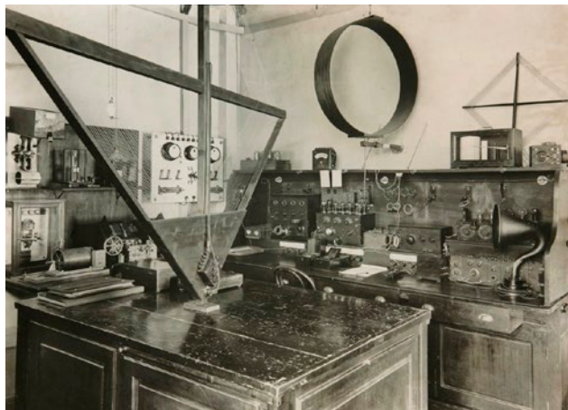
Figure 3. The radiotelegraphy station of Father Alfani at the Ximeniano Observatory. 2