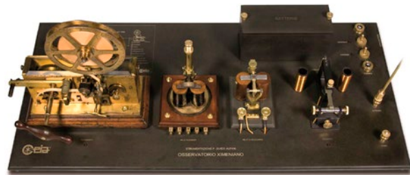
Figure 5. Radio receiver built in 1923 according to the model of Marconi’s receiver dating back to 1895. 4 A part from the battery box, all the other components like the coherer (right lower part, near to the antenna) are original.

S.p.A” executive, but also very keen on radio engineering. Since then a very methodical work has begun to recover, restore and put that Laboratory (Figure 3) back on its feet. It took about six/seven years to finish the work, but nowadays more than 95% of Father Alfani’s Laboratory is on exhibit at the Ximeniano Observatory. 4 It is made of 44 parts ranging from the radiotelegraphy station built in 1912 and already depicted in Figure 4 to several other equipments dating back to 1940 and perfectly operative. The radiotelegraphy station has been restored by using the original Ducretet & Roger thermionic diode, which was found by chance in the Observatory’s store-rooms. Actually the station has been tuned again so as to receive the national broadcast “RAI” in amplitude modulation. Another noteworthy article is the radio receiver dating back to 1923 and shown in Figure 5, with its original coherer.