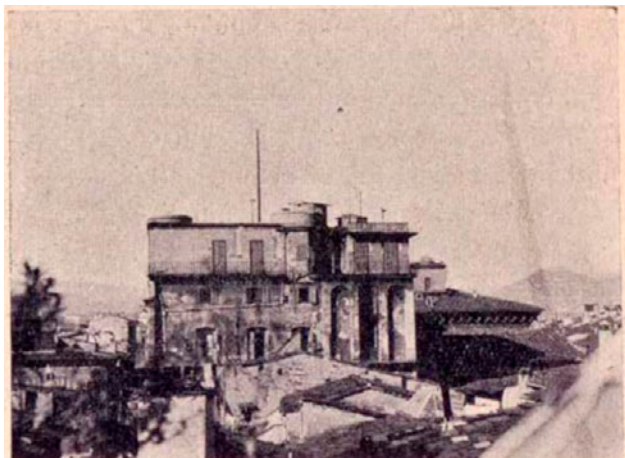
Figure 1. The Ximeniano Observatory seen from South and showing the antenna of the radiotelegraphy station. 3

trolytic diodes” because “they are much more constant than crystal sets”. He had to deal with some drawbacks he promptly pointed out to the Company, thus quickly managing to have reliable components. He kept on working on the improvement of the receiving system; thus in 1923 he exploited the coherer as radio detector in his receiver, only to change in favor of vacuum tubes, once their checkout had turned out to be trustworthy.