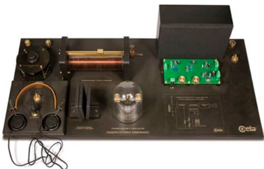
Figure 4. Radio receiver built in 1912, the model of it is in the booklet Father Alfani dedicated to Marconi during his visit held in 1912. 4 The diode, head-phones and the capacitor are original.

S.p.A” executive, but also very keen on radio engineering. Since then a very methodical work has begun to recover, restore and put that Laboratory (Figure 3) back on its feet. It took about six/seven years to finish the work, but nowadays more than 95% of Father Alfani’s Laboratory is on exhibit at the Ximeniano Observatory. 4 It is made of 44 parts ranging from the radiotelegraphy station built in 1912 and already depicted in Figure 4 to several other equipments dating back to 1940 and perfectly operative. The radiotelegraphy station has been restored by using the original Ducretet & Roger thermionic diode, which was found by chance in the Observatory’s store-rooms. Actually the station has been tuned again so as to receive the national broadcast “RAI” in amplitude modulation. Another noteworthy article is the radio receiver dating back to 1923 and shown in Figure 5, with its original coherer.