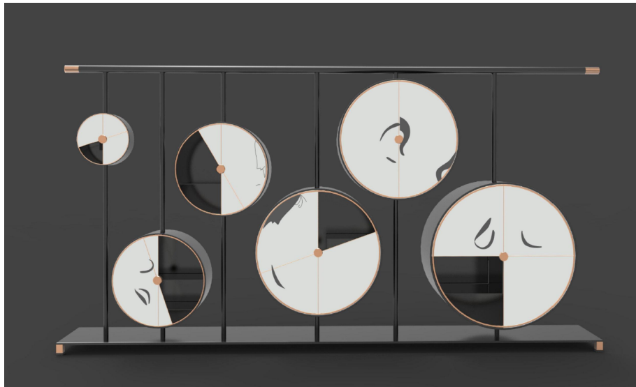
Figure. 2. A Wardrobe inspired by Chinese shadows theatre