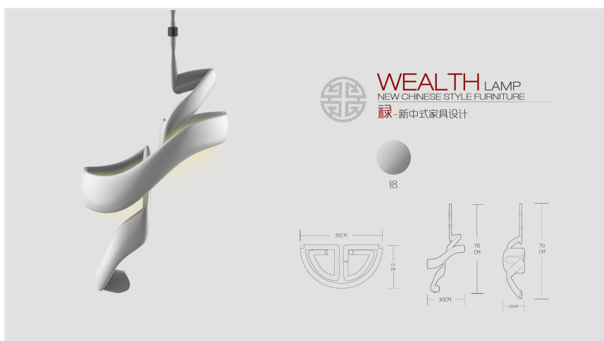
Figure. 4. A Ceiling lamp interpreting in a contemporary way the Chinese Graphics and Calligraphy