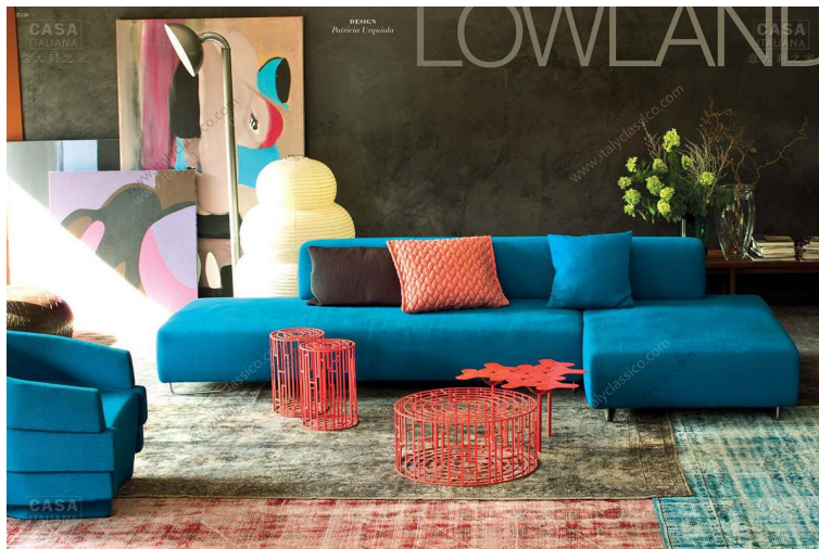
Figure. 1. Furniture of Moroso (from Moroso home page)