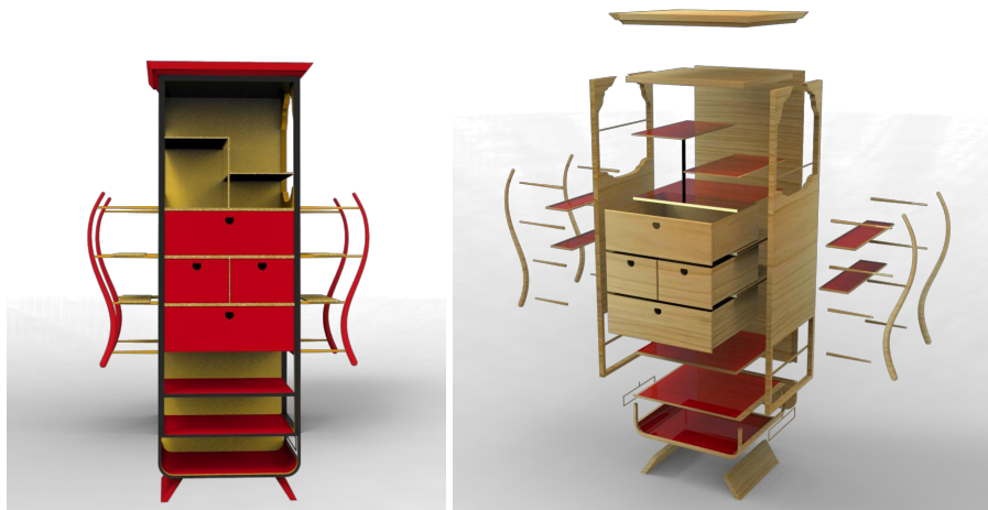
Figure. 6. Jia Ju Cabinet 1

Jia Ju research uses selected references from history of Italian design as a guideline for interpreting the state of the art and the possible evolution of Chinese furniture design as an integration in between traditional shapes and contemporary re-design. As in Chinese manufacturing, Italian design emerged as a syncretic evolution from an historical craftsmanship know-how. So, a confront in between Italian history of design and manufacturing and Chinese transformation in furniture design could represent a strategic work to set significant design guidelines. From this dialectical approach the Jia Ju project created some furniture concepts aiming at visualizing possible evolutions and guidelines of this synergy in between Chinese historical shapes and new design interpretations.