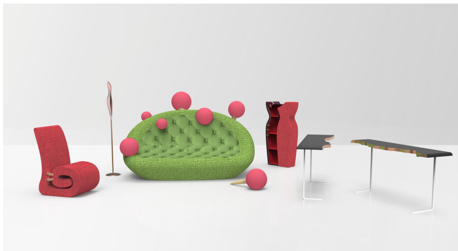
Figure. 3. A Set of Furniture