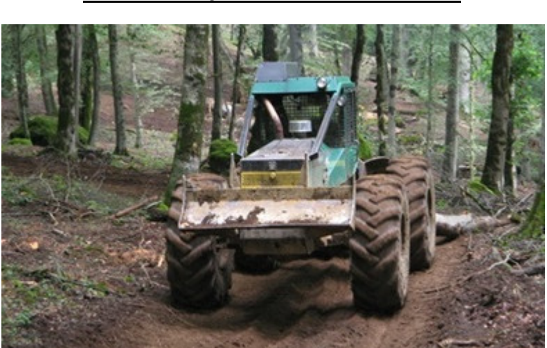
Figure 1. The Timberjack 450C used for skidding operations.