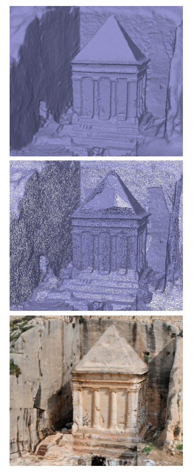
Figure 3. The SfM (Structure from Motion) process within Agisoft Photoscan, showing details of Zechariah's tomb.