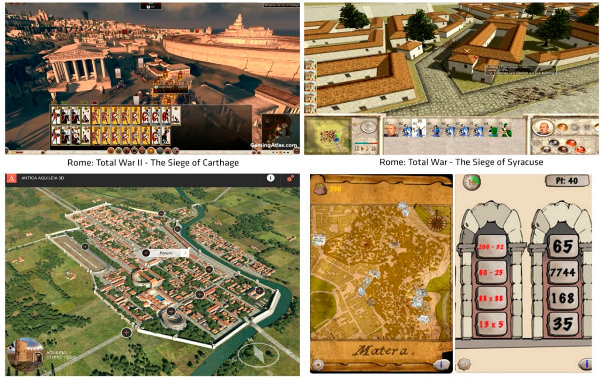
Ancient Aquileia 3D