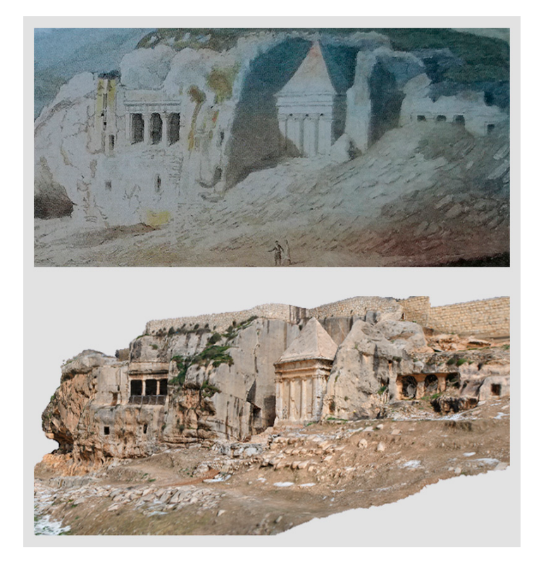
Figure 5. A comparison of the textured 3D model with a lithograph from Brockedon et al. [7] (p.155). The level of the ground today is noticeably lower as it was excavated in recent times.

The current appearance of the tomb complex is not very different from what was represented in the past, except for the level of the land that was excavated in recent times (Figure 5).