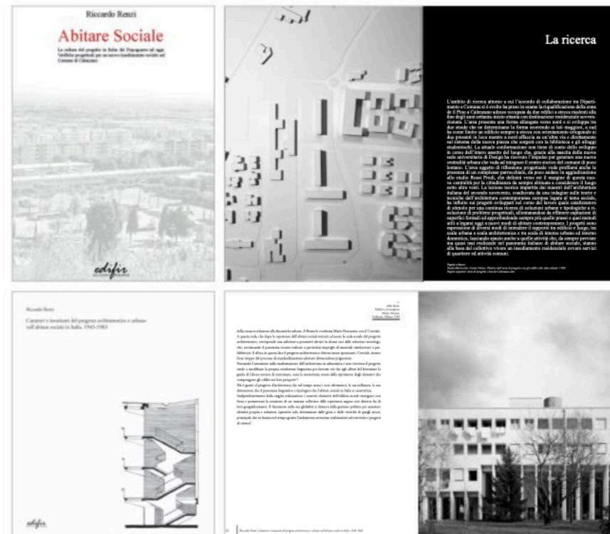
R. Renzi, Abitare Sociale. La cultura del progetto in Italia dal Dopoguerra a oggi. Verifiche progettuali per un nuovo insediamento sociale nel Comune di Calenzano , Edifir, Firenze, 2013.