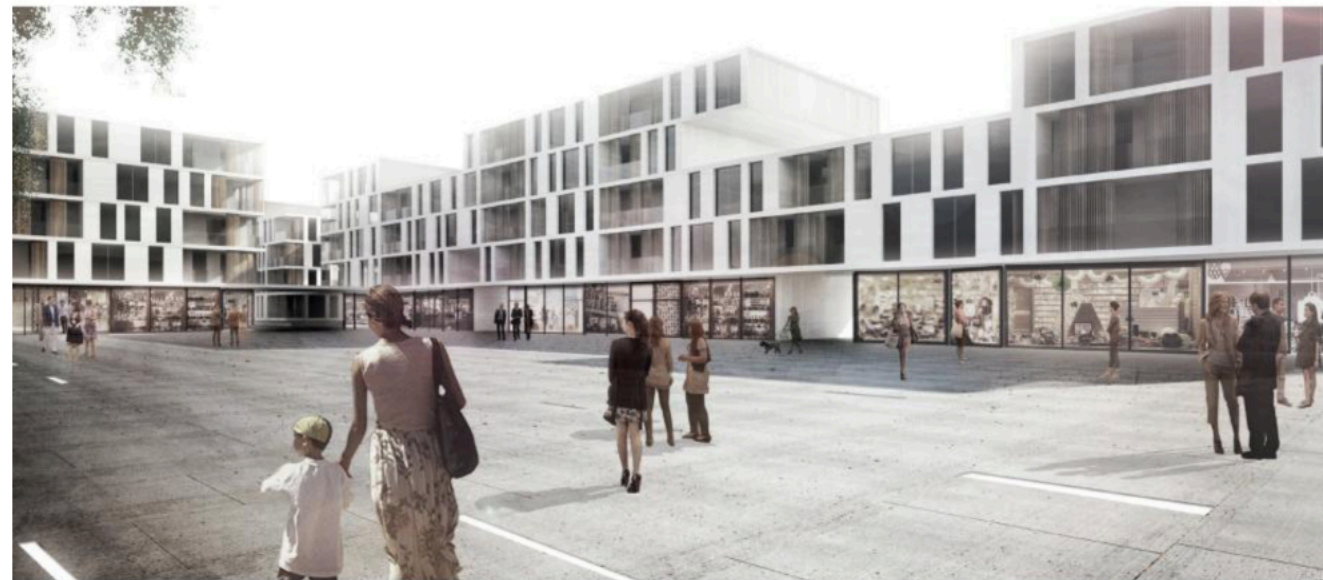
Main civic space, from preliminary studies for a new residential dwellings in Calenzano (near Florence), 2015.