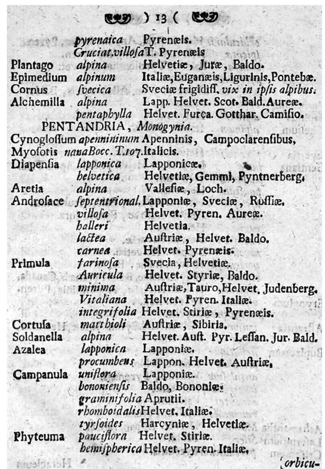
Fig. 1. Page 13 of Linnaeus's Flora alpina (1756) with citation of Myosotis nana and reference to Boccone's plate 107 (see Fig. 2).

One of these taxa is Eritrichium nanum (L.) Schrad. ex Gaudin, a well-known alpine plant in Boraginaceae subfamily Cynoglossoideae tribe Cynoglosseae (Chacón & al., 2016) and the only European member of the genus Eritrichium Schrad. ex Gaudin. It is a dwarf, pulvinate and densely hairy perennial plant with bright blue flowers that grows in rocky sites at elevations between 2500 (rarely 1900) and 3750 m a.s.l. (Selvi, 2018). This species represents a widespread polymorphic complex of closely related taxa including E. aretioides (Cham.) DC., E. chamissonis DC., E. nanum s.str. and E. villosum (Ledeb.) Bunge, and growing in the Alps and the Carpathians, the Caucasus, Inner Asia, North Siberia and in the Rocky Mountains from Alaska to Colorado (Zoller & al., 2002). According to European authors (e.g., Meusel & al., 1978; Aeschmann & al., 2004; Valdés, 2011; Selvi, 2018), E. nanum s.str. is endemic to Europe, while the other taxa of the complex occur in Asia and North America (see also Wight, 1902; Murray, 2013). Further studies are needed to address systematic uncertainties in this group, and typification of E. nanum is a first necessary step to this purpose. In fact, the name Myosotis nana has never been typified, and the validity of the basionym