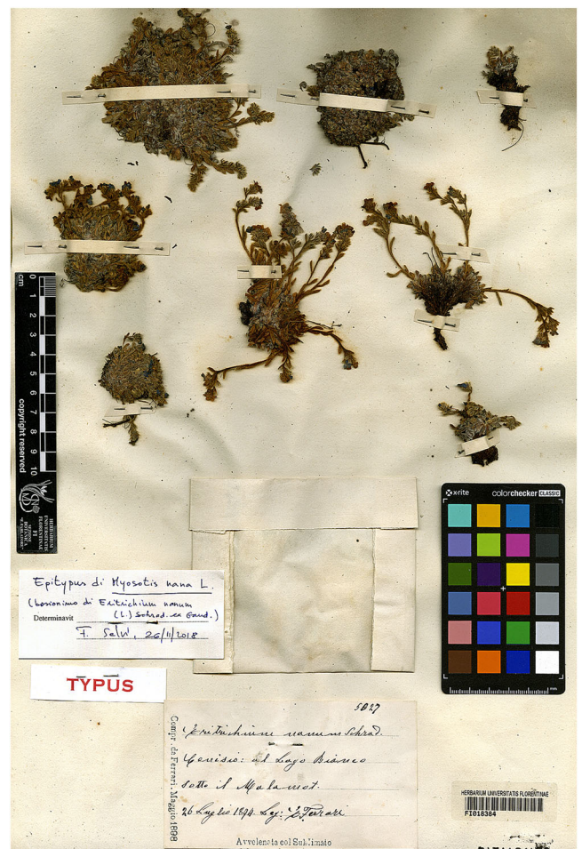
Fig. 3. Epitype of Myosotis nana L. from Mount Cenis (FI barcode FI018384).

For images of the lectotype and epitype, see Figs. 2 and 3, respectively.