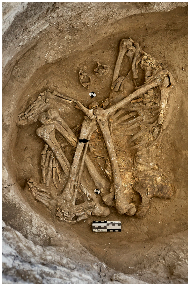
Fig. 2. Çatalhöyük burial F.2232 is a headless young adult female (13162) with a fetal skeleton (13163; arrow) in her abdominal region. The 2 individuals were the first in a sequence of interments in a burial pit in the east platform of Building 60, dating from the Late Period occupation at Çatalhöyük. Skull removal was an element of mortuary treatment in this Neolithic setting.

Addressing questions about lifestyle and quality of life in such a large Neolithic settlement provides a unique perspective for developing an understanding of the level of commitment to production and consumption of domesticated food products, the amount of labor and workload demands invested in feeding and sustaining the community over the course of its occupation history, and the types of social and behavioral patterns associated with these practices. The period of 7,000 to 9,000 y ago is a critical time for this community, representing the inception and evolution of sedentism, labor demands and lifestyle, dependence