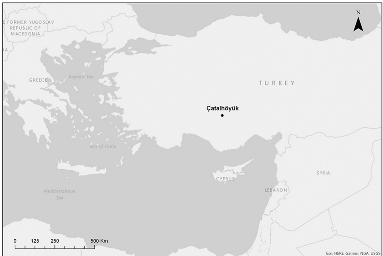
Fig. 1. Regional map of Turkey and the Mediterranean basin showing location of Çatalhöyük.

One such community is Neolithic Çatalhöyük, located in the Konya Plain on the Anatolian plateau of south-central Turkey (Fig. 1). Çatalhöyük includes the material remains of one of the most well-known Neolithic megasite communities and is