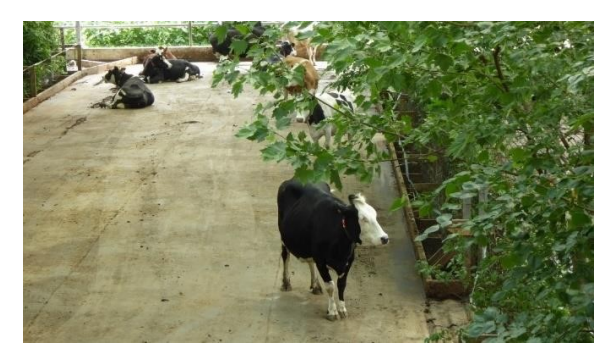
Figure 3. An inside view of a "Cow Garden" in the Netherlands. The "High Quality Floor" is used in the resting areas. Trees and shrubs are planted among the alleys.