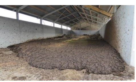
Figure 2. A. The High Welfare Floor allows to separate urine and feces. The surface is cleaned by means of a robot; B. The solid manure collected by the robot can be stored separately allowing a better use in the fields.

In "Cow Garden", the "High Welfare Floor" is used mainly in the resting area of the animals, but in this innovative housing system low trees and shrubs are placed inside the barn with the aim of providing a more natural living environment to the animals (Figure 3).