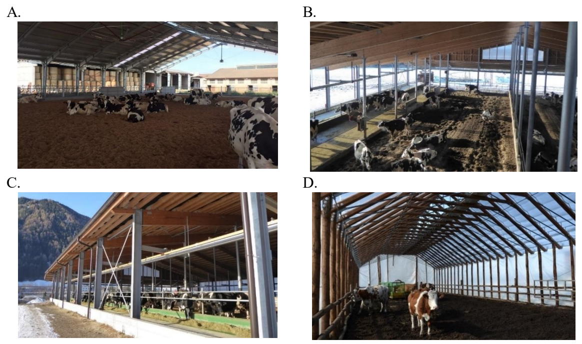
Figure 6. A. A large herd kept in a compost barn in North Italy (Mantua province); B. A compost barn with a structure realized in steel and laminated timber. Emmer husks are used in the ban as bedding material; C. The compost barn is always realized with large openings. The walls are not provided also in mountain areas with cold winter. The building in the picture is placed in North Italy (Vipiteno, Bolzano); D. Concepts of Design for Deconstruction are applied in the compost barn shown in the picture.

recyclable, renewable, locally available and environmentally friendly raw materials, with low environmental and economic impact according to six main principles for sustainable construction: to minimize resource consumption; to maximize resource reuse; to use renewable and recyclable resources; to protect the natural environment; to create a healthy and non-toxic environment; to pursue quality in creating the built environment (Leso et al., 2018). The Figure 6 shows a prototype of a building realized applying the DfD principles for a compost barn in the region of Piedmont. The entire facility can be completely removed (and most materials recycled) when obsolete (expected life time 20 years).