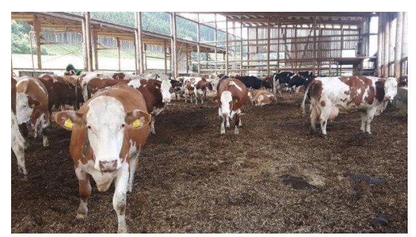
Figure 5. An Austrian compost barn with timber structure.

and economic situations, which means that it needs some time so as to be able to manage a compost barn at best (Burgstaller et al., 2016). At present (2018) there are about 80 - 85 compost barns in Austria, being managed by means of the most different materials (Figure 5).