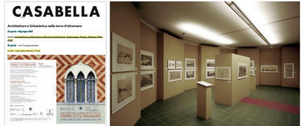
Exhibition and catalogue Architettura e urbanistica nelle terre d'oltremare. Dodecaneso, Etiopia, Albania (1924-1943) , Ex-Gil, Forlì, 2017.