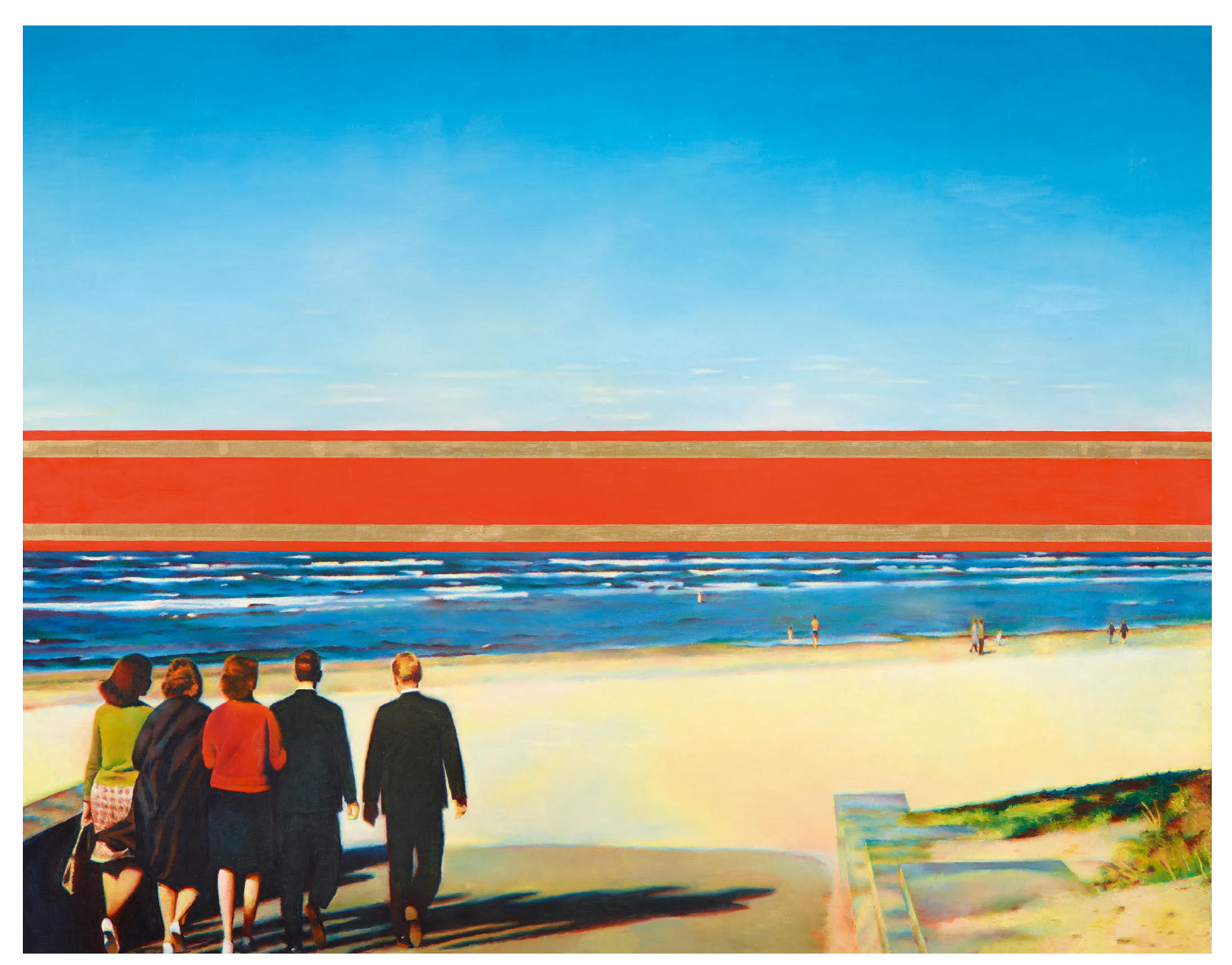
Erik Bulatov, Red Horizon , 1971–72. Oil on canvas, 140 x 180cm.