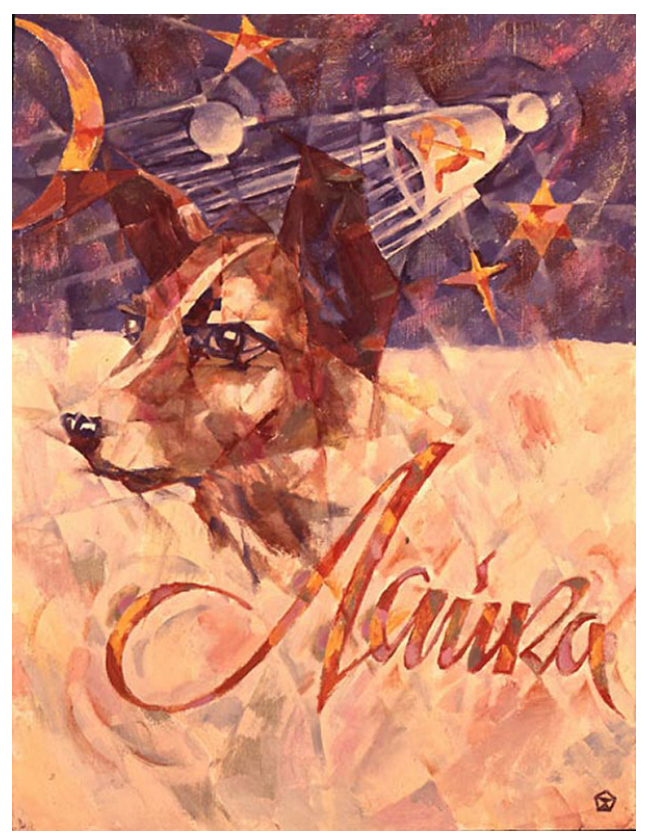
Komar & Melamid, Laika Cigarette Box , 1972. Oil on canvas.

The passage of these two decades marked the disappearance of the unofficial Soviet art scene and the emergence of so-called post-Soviet or Russian contemporary art, produced by artists who gradually found the freedom to express and spread their artistic vision worldwide, beyond the bounds of the USSR. However, their nonconformist attitude from the Soviet years was not easy to erase, and it continued to define their art production in the 1990s. As part of the unofficial Soviet art scene, Moscow conceptualists worked at the margins of