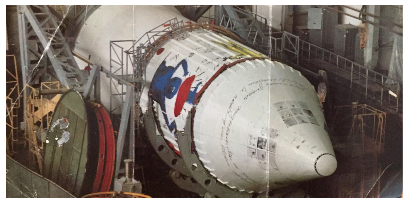
\label{eq:photo} Photo \ of the space \ rocket \ featured \ in \ a \ leaflet.