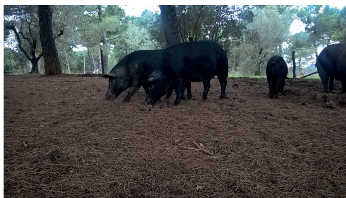
Figure 2. Apulo-Calabrese sow with piglets.