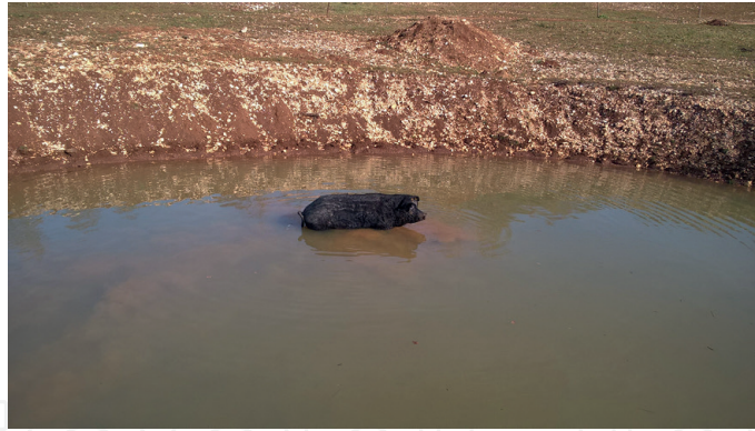
Figure 3. Apulo-Calabrese boar.