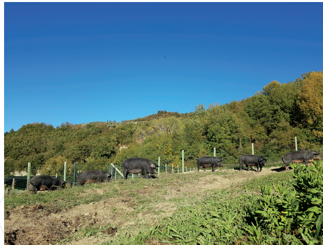
Figure 3. Mora Romagnola pigs on pasture.