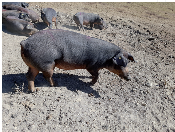
Figure 2. Mora Romagnola sow.