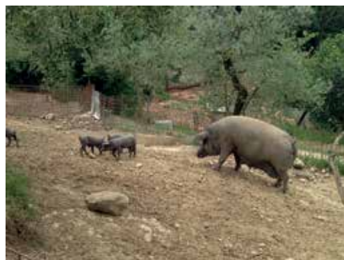
Figure 2. Casertana sow with piglets.

Casertana breed is raised in different Italian regions: Campania, Molise, Lazio and Umbria [3]. The traditional breeding technique foresees a wide use of grazing in beech, chestnut or oak woods, with poor feed integration and with large spaces where the Casertana pig can freely graze [5]. Currently, most of the animals are fattened according to modern breeding techniques, with the use of protein nuclei and integrated feed even if breeding with extensive and semi-extensive management is still present, usually in the oaks. When animals are intensively raised, they are kept continuously confined with basic heat protections available even if the environment is not completely climate controlled.