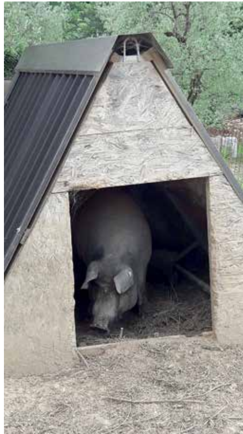
Figure 3. Casertana boar.