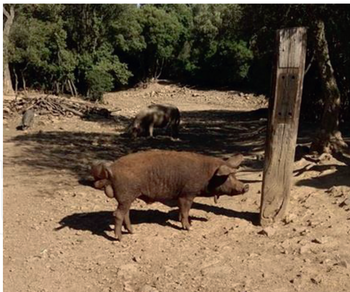
Figure 3. Sarda boar.

control or fences with frequent exchanges between wild boars and domestic pigs. This is one of the reasons of the difficult eradication of the African swine fever (ASF) disease as reported by Jurado et al. [7]. Animals often graze on public lands, with minimal recourse to shelters consisting of hollow trunks or shelters (in wood and/or stone). Animals are fed mainly on the natural resources of the oak and chestnut woods where they graze freely; the integration is minimal and commonly consists of cereals (flour or grain) or legumes, offered during periods of food shortage. With this production system, the animals remain in the herd during more than 1 year and they are slaughtered quite old. It is thus common to simultaneously have young pigs, middle aged pigs, and old animals (up to 3 years of age and more than 100 kg). Furthermore, seasonality of the events (births and slaughters) is a common management practice in Sarda breed. Animals are accustomed by the farmers to respond to their voice calls at pre-established points, where they receive the daily amount of food, directly offered on the ground [8].