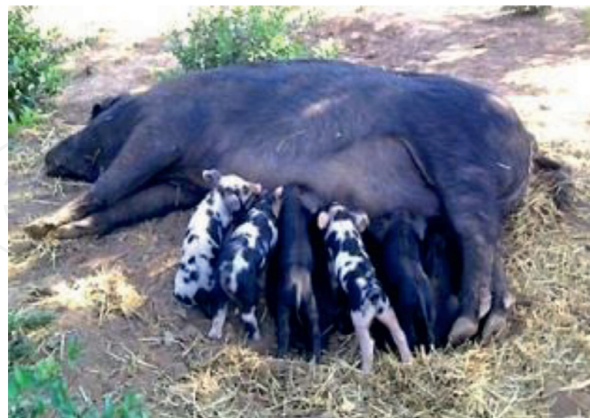
Figure 2. Sarda sow with piglets.

The Sarda is a small size breed with black, grey, tawny or spotted coat colour (Figures 2 and 3). The bristles are numerous, long and rough, and on the dorsal line, they make up a mane. A lumbar tuft is possible. The head is of medium development, cone-shaped with a straight profile, small ears kept high up or leaning on the side. Wattles are sometimes present. Long tail with bristles sometimes forms a characteristic “horse” tail. Even if the breed presents large phenotypic variability, some morphological traits are considered indicators of crossbreeding and are thus cause of exclusion from the registry: absence of bristles, totally depigmented skin, straight ears, concave profile, striated cloak or agouti, presence of white band, even partial, on the chest. Sows of Sarda breed have on average 12.7 teats.