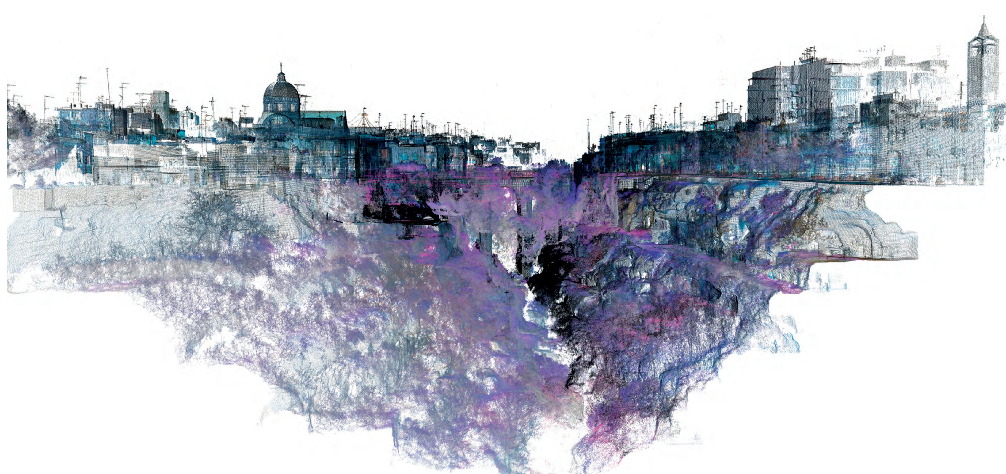
Massafra - The ravine landscape

RESEARCH UNIT PROJECT PRIN_2010/13 (13/15)