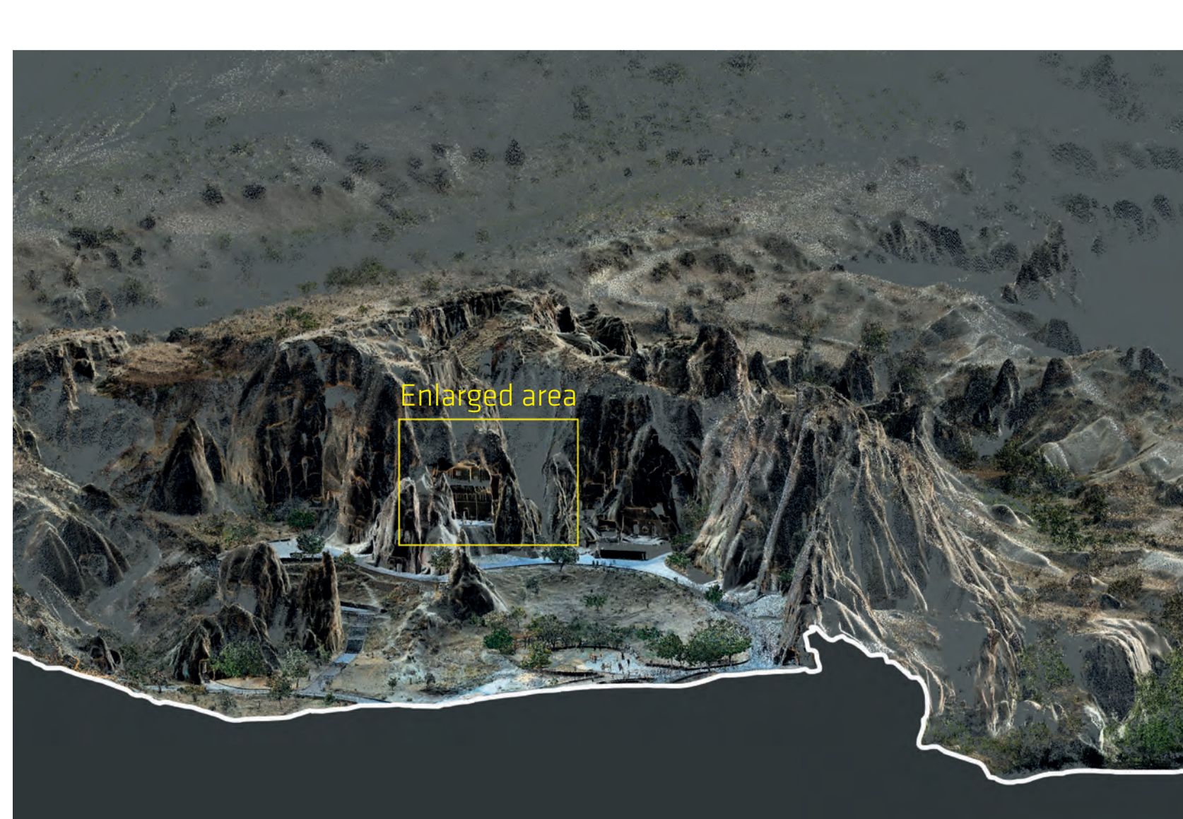
Göreme - Landscape Open Air Museum