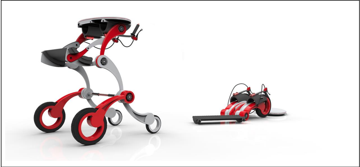
Figure 7. Walker - opened and closed - with accessories, table top and soft seating. Concept by: A. Panebianco, L. Quercioli