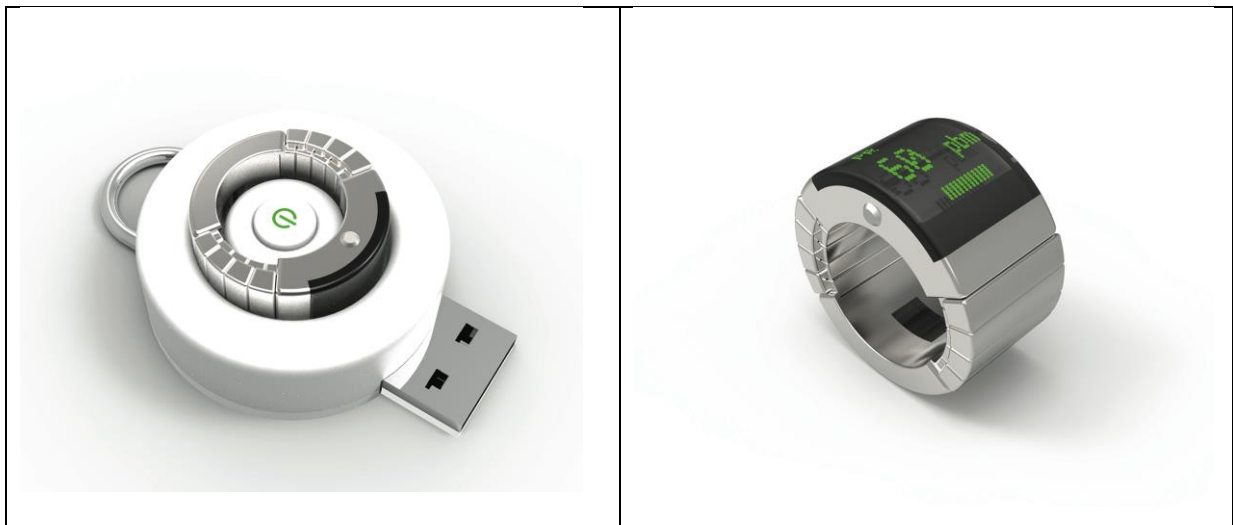
Figures 3-4. Pulse-oximeter ring, for measuring blood oxygen saturation and heart rate. The picture shows the device and the base charger, with integrated USB for data transfer. Concept by: C. Gasparri, J. Venturi