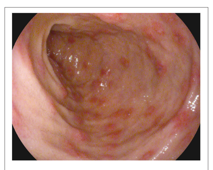
FIGURE 1 | Esophagogastroduodenoscopy evidence of multiple hyperemic and hemorrhagic round-shaped lesions in distal duodenum.

For the persistence of abdominal pain, an esophagogastroduodenoscopy was performed, which revealed pyloric edema, multiple hyperemic and hemorrhagic lesions with round shape in the duodenal bulb and descending duodenum, some of them were ulcerating ( Figures 1 , 2). Histological