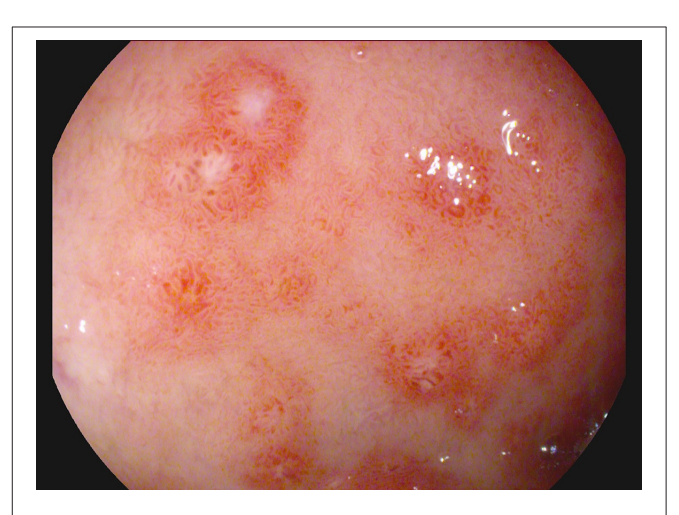
FIGURE 2 | Detail of duodenal lesions (PENTAX i-scan imaging).

examination showed active but non-specific inflammation with eosinophilic component and IgA deposition (Figure 3).