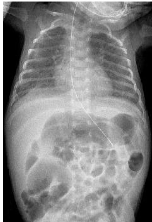
Fig. 3 Chest x-ray at discharge. Chest x-ray at 78 day of life showing the disappearance of the fibrin glue

Previous studies reported eleven cases of persistent PTX sealing with fibrin glue in very preterm infants [1, 2, 7–9] (Table 1). As in our case, fibrin glue pleurodesis was successful in all survived patients in whom PTX resolved within 48 h from the treatment as demonstrated by control chest x-rays [1, 2, 7–9]. The dose of fibrin glue varied from 3.5 [2] to 10 mL [7], in relationship to different