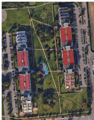
Figure 1 Picture of the buildings and of the area that will be retrofitted. The sectors available for solar field are highlighted. Between the two buildings the area where TES will be built.

Due to complexity of the system, a numerical analysis is necessary to design properly a seasonal thermal energy storage. The solar field, from project, must guarantee 750 MWh/y minimum and available solar field area is limited by the roof buildings ( Error! Reference source not found. ).