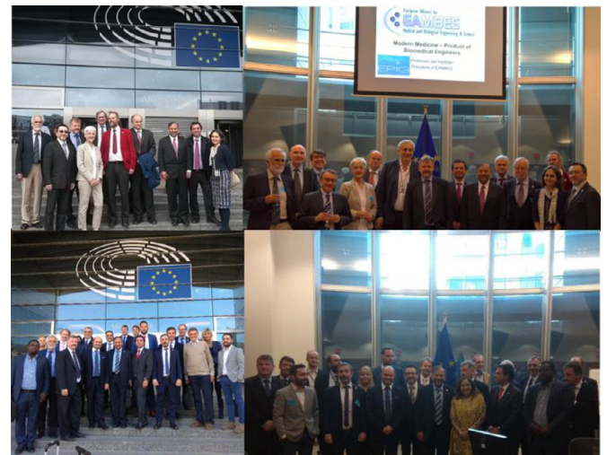
Figure 5. EPIG on BME meetings: two top photos are from the 1st meeting in May 2015, the two on the bottom are from the 2nd meeting in October 2018.

At the European level, the IFMBE HTAD worked in strict collaboration with the EAMBES (European scientific society of biomedical engineers) aiming at supporting the European institutions by providing technical support for policy initiatives regarding medical devices, medical facilities and related human resources. This collaboration was also functional to foster the promotion and stronger recognition of BME as an independent occupation in Europe and to establish the European Community of BME as valuable stakeholder