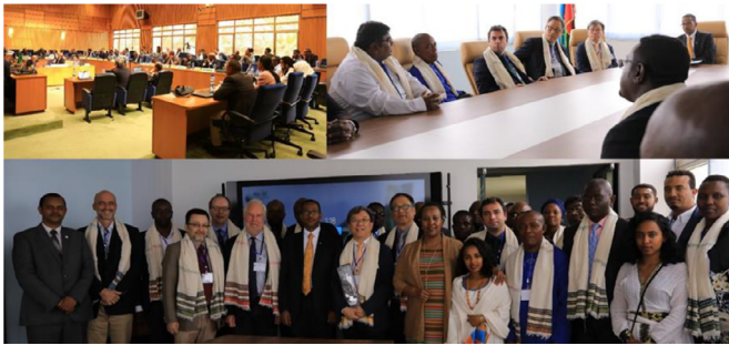
Figure 5. Launch of the first African Working Group on BME in the Africa Union headquarters (top-left), IFMBE delegation meeting the Ethiopian ministry of Science and Research (top-left and bottom photos).

on those four points, achieving significant results presented in the last EPIG on BME meeting held in October 2018. Among others, one of the most impressive was the introduction of the BME profession in the European Skills, Competences and Occupation (ESCO) database, which is an equivalent of the UN ILO ISCO, and, likewise, was not yet listing BME as an independent occupation since 2016 [25].