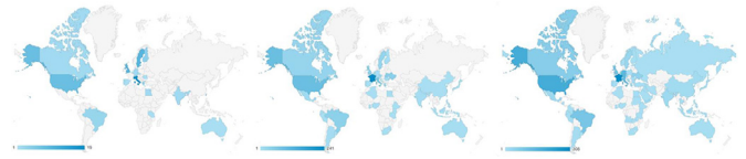
Figure 2. Distribution of users of the IFMBE eLearning platform since its launch. From left: 76 users from 14 countries in August 2017; 722 users from 48 countries in August 2018; 1423 users from 70 different countries in August 2019.

Launched in September 2016, the eLearning platform has had a significant and fast-growing number of users, from the entire world (Fig. 2), 76 different users from 14 countries in August 2017,