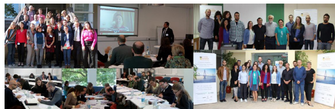
Figure 1. Participants of summer schools on HTA for BME organised by the IFMBE HTAD respectively in 2015 (left) and 2017 (right).

When required, ethical approvals were sought at the home institutions of project coordinators.