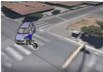
Fig. 1. Case-study crash conditions.

The results of the simulations showed that a late intervention of the PCB with deceleration of 0.3 g could have produced an impact speed reduction of 3.2 km/h. Assuming an automatic deceleration of 0.5 g, impact speed reduction could have been 5.4 km/h. Similar effects were obtained with early intervention of the PCB system at low deceleration, whereas the combination of early intervention and higher deceleration could have produced an impact speed reduction of 8.6 km/h (Table I).