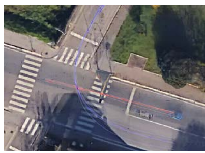
Fig. 2. Real-world trajectory overlap.