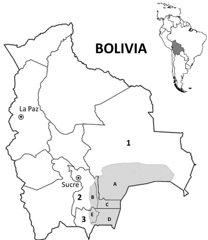
Figure 1. Map of the Bolivian Chaco (grey area).

The area of the Bolivian Chaco lies in the south-east of the country, and includes 3 Departments (numbers on the map: Santa Cruz = 1; Chuquisaca = 2; Tarija = 3) and 5 Provinces (letters on the map: Cordillera = A.; Hernando Siles = B; Luis Calvo = C; Gran Chaco = D; O'Connor = E).