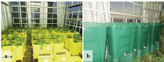
Fig. 2 - Photo of the greenhouse experiment at the University of Florence, Italy: (a) bioretention pot prototypes, (b) 200-L plastic water storage tanks.

old plants of Lonicera pileata Oliver, Cotoneaster horizontalis Decne., and Hypericum hidcoteense 'Hidcote' were potted in the containers. Each pot contained 2 plants of the same species, namely Lonicera pileata (Lp), Cotoneaster horizontalis (Ch), and Hypericum hidcoteense 'Hidcote' (Hh), or plants of two species, in all possible combinations (Lp + Ch, Lp + Hh, and Ch + Hh). 5 additional pots were prepared as previously described but left unplanted. The experiment was carried out from October 2013 until June 2014. Plants were grown at 28/18°C day/night temperatures and exposed to natural daylight, and the light transmission was of 90%. Relative humidity was always above 60%.