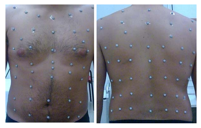
Figure 1. 89 marker model for respiratory acquisition. 42 markers are placed in front and 47 on the back of the subject.