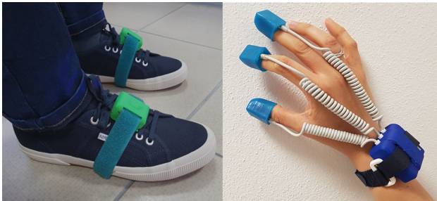
FIGURE 2. The wearable system: SensHand and SensFoot.

plane where the thumb and middle finger joined was parallel to the table. The thumb and middle finger were in contact in the starting position; then, the subject touched the middle finger to the thumb.