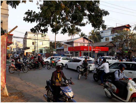
Fig. 11 This is the corner of 69 and 41 Streets, one of the places often affected by traffic jams, accidents and robberies. This place needs traffic lights and security