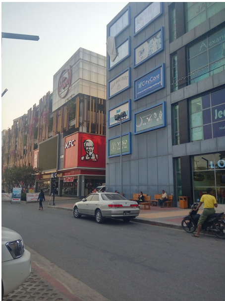
Fig. 9 The Mingalar Mandalay area is the place that has changed the most in the city. It was a plain place. But now it has become one of the most popular places in the city, with a shopping centre, sports stadium and sports academy, hotel, banks and training centres

The photo-route by N.I. and Y.M.M., centred around the topic of food, is particularly significant in this tension between tradition and modernization, local and global. The two participants record various urban markets and street food stalls where you can eat “typical” meals of Burman tradition, ending up at the “Lotteria” fast food located at the Mingalar Mandalay complex (Fig. 10).