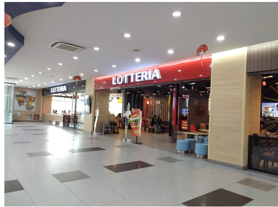
Fig. 10 Lotteria. The fast food chain we like the most. We can buy the things that we need in one place