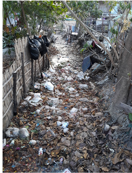
Fig. 13 The water channels are blocked by rubbish. So, these channels are the main cause of floods in the rainy season and the reproduction of mosquitoes

It has been observed how, more than more conventional techniques, the use of experimental, creative and storytelling approaches to explore and recount space is capable of grasping the “processual, polyvocal, always-becoming” (Price 2004, p. 1) nature of places. In addition, “other ways of storying landscape” may help make “sense of transience” in space (Desilvey 2012, pp. 32–33; see also Ward 2014). In the same way, according to Lombard (2013p. 28) “photos taken by residents tend to illustrate the complexity of place more successfully than photos taken by the researcher”. In a context undergoing great transformation such as that of Mandalay, photo-routes proved