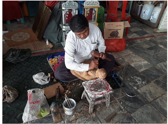
Fig. 7 Wood carving is one of Myanmar's traditional handicrafts but now this tradition is becoming rarer and has almost disappeared in some places

of the Palace).” M.M. and S.T. instead show their concern for the progressive disappearance of traditional crafts (Fig. 7).