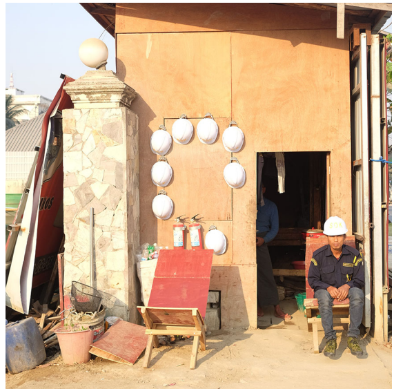
Fig. 8 Shwe Wah Htun Street. The construction site was off limits but I think this photo of a construction worker pretty much shows what's happening in the new town: building, building, building!

In contrast to the images portraying aspects linked to identity and tradition, there are shots that dwell on the urban transformations underway and the new spaces that the participants perceive to be taking on a central role (Fig. 8).