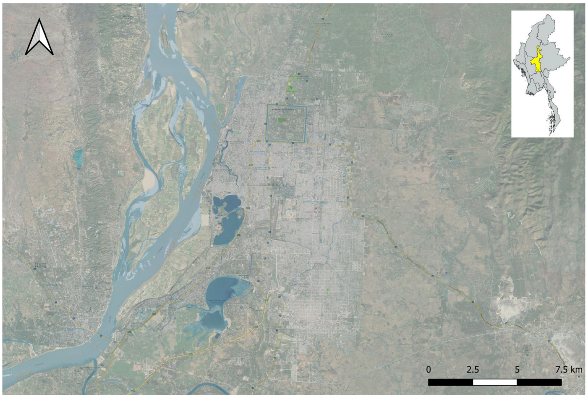
Fig. 1 Map of Mandalay and surroundings

Development Bank (ADB) with the aim of establishing a multimodal land-transport transnational infrastructure (Rimmer and Dick 2019); nor that, due to its vicinity to China, Mandalay is considered as a focal point in the Chinese expansion strategy in the region through the One Belt One Road Initiative (Gong 2019) and, more precisely, the China–Myanmar Economic Corridor (CMEC). Officially launched in 2018, and building on recently ultimated gas and oil pipelines (Zhao and Yang 2012), the CMEC aims at developing a road and rail transportation route from Yunnan Province in China through Muse and Mandalay to Kyaukpyu in Rakhine State, including a notable railway project connecting Muse to Mandalay. Even though it is publicly considered as a mutual economic opportunity for both Countries, the corridor is contested under several perspectives (Zhou 2019; Heinrich Böll Stiftung Yangon 2019). As an example, there is scepticism around the increasing influence of China in Myanmar and the democratic and transparent management of some sensitive internal affairs, such