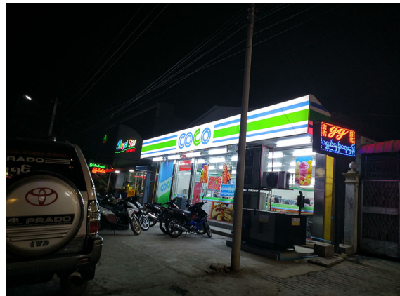
Fig. 4 Most of the students use to go to Co Co, a mini-market, to enjoy ready-made noodle and hot dog

Among the various places in the students' everyday lives, the Mandalay University campus holds a particular status, both in the participants' images and their comments. It is not just the place where some participants live and where they all go to lessons, eat meals and spend part of their days. More metaphorically, the campus represents a place of shelter, a green oasis in the heart of the frenetic hubbub of the city (Fig. 5).