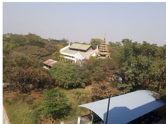
Fig. 5 Mandalay University Campus. There are so many more trees than in other places in the city

A second group of images portrays places and symbolic situations that create a significant tension