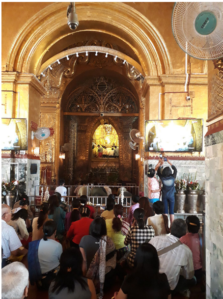
Fig. 6 Mahamuni Buddha image. This image is regarded as one of the symbols of Mandalay and reflects the religious belief of Buddhism

In this historical-cultural approach to the urban landscape, in which the photo assumes an essentially "documentary" function, the participants seem in part to conform to a sort of touristic gaze (Urry 1990) in the narration of the city. Other shots instead capture specific components of the intangible heritage, such as traditional crafts, religious rites and ceremonies, which are evoked as representing local culture. The participants make more subjective comments and assessments on these components. On commenting a series of images on the various phases of workmanship in a gold embroidery workshop, J.J. underlines: "I've liked this place since I was a child and I'm so fascinated when the artisans work the gold. This is also one of our tourist attractions in Nan Shei (eastern part