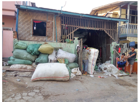
Fig. 14 Recycling shop: I want to show that Mandalay’s citizens don’t just dump trash, they also sell or recycle it

to be an effective methodology both in view of capturing and immortalizing the manifestation of this sense of transience in the urban space. Not only that, it is a way of expressing a critical and conscious gaze over the city, its current changes, and the relationship between its subjectivities and the spaces in the city. In other words, the photo-routes enabled the urban