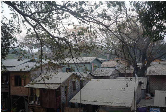
Fig. 12 Myo Patt Street. The houses near it have blankets of dust on their roofs from all the highway traffic!