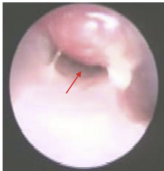
Figure 2 Bronchoscopy showing luminal obstruction of the right main bronchus caused by tuberculous granuloma.

At 9 months of age, another therapeutic bronchoscopy with clearance of a new granuloma of the right bronchus was required. Prednisone was stopped after 3 months, and the antituberculous drugs were stopped after 15 months of treatment. The result of follow-up bronchoscopy at 2 years of age was normal, and a chest x-ray showed nearly complete resolution of the TB lesions. At 6-year follow-up, the patient was developing well and was completely asymptomatic.