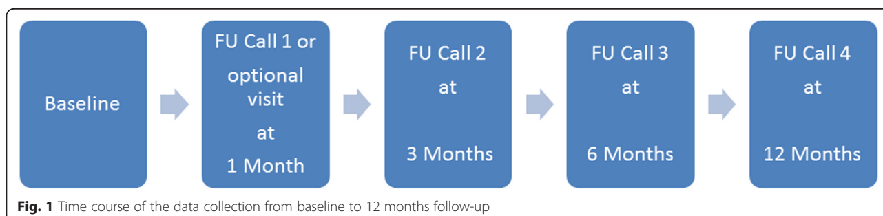
Fig. 1 Time course of the data collection from baseline to 12 months follow-up

The study aimed to achieve a general ratio of PE:DVT which was approximately 2:3 resulting in a total number of PE (with or without DVT) patients