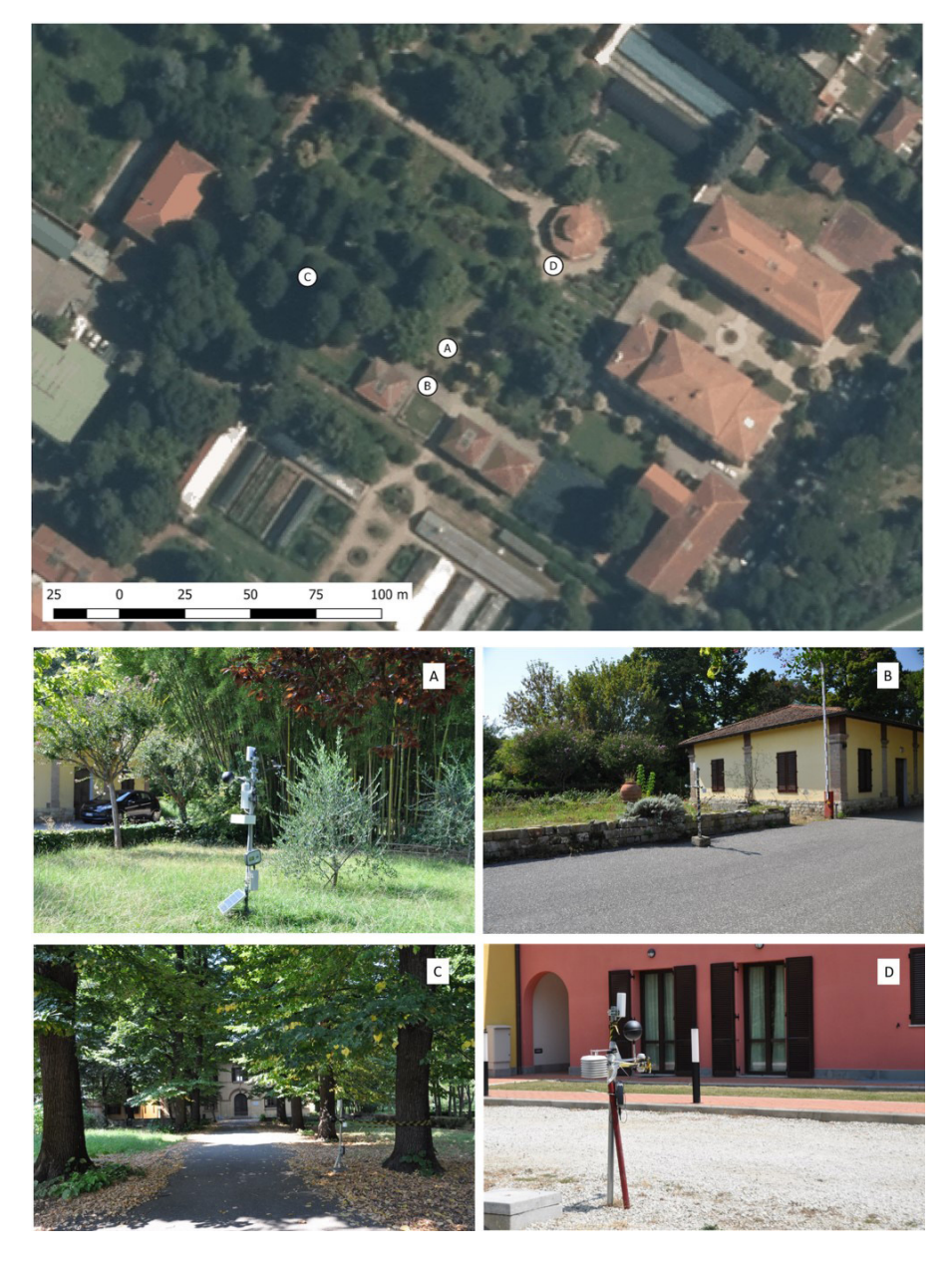
Figure 1. Study area and location of the micrometeorological stations: A) sun-exposed grass (Exp Grass); B) exposed asphalt (Exp Asphalt); C) shaded asphalt (S Asphalt); and D) exposed gravel (Exp Gravel).

humidity (RH), wind speed and globe temperature (Tg) were taken during calm and clear days using four micrometeorological stations located at 1.7 metres above the respective surfaces (Figure 1). All of the micrometeorological stations were located within a radius of less than 100 metres. Each micrometeorological station was equipped with sensors for measuring air temperature (Ta) (°C), relative humidity (Thermo-hygrometer PS-0062-AD, Netsens) (%), solar radiation (MJ m<sup>-2</sup>) (Global radiation sensor, Netsens), wind speed (ms<sup>-1</sup>) (Anemometer 6410, Davis Instruments Corp.) and globe temperature (Pt100 sensor, globe Ø 150 mm, Delta OHM). Mean radiant temperature (MRT, based on Tg) and the above-mentioned meteorological parameters were used to calculate UTCI. Data were collected every 15 minutes, and hourly averages were calculated for data analysis.