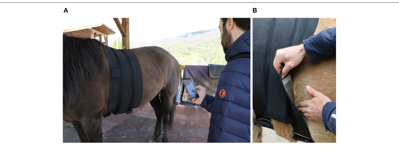
FIGURE 1 | The monitoring system worn by tested horses. In (A), the belt placed on the horse's chest and wirelessly controlled by a mobile app; in (B), one of the electrodes integrated in the elastic belt.