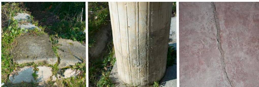
Fig. 2. (a) Damage due to vegetation on the pavements; (b) Saline efflorescence on a column; (c) Reopening of a crack on a wall near the slope.