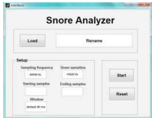
Fig. 2 User-friendly interface of the implemented software tool.

In our study, STE is evaluated in signal windows of 40 ms in length with 50% overlap between adjacent windows. In order to determinate boundaries of “sound” events, we computed the histogram of the signal energy and the Otsu method is iteratively applied to obtain two thresholds: the upper one t_u and the lower one t_l [16], [17]. These thresholds are then used to find the starting and ending points of each “sound” event in the audio signal. In particular, when the STE curve overpasses the upper threshold, the first point under the lower threshold (on the left side of the curve with respect to the upper threshold) is detected in order to get the starting point. When the STE curve falls down t_l , the ending point of the event is found (Figure 3).