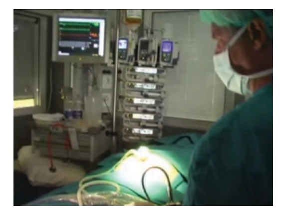
Fig. 24.1 Scenario of BDL in ICU

Excellent communication between the surgeon and anesthesiologist is required as the patient is mechanically ventilated and invasive arterial blood pressure, electrocardiogram, pulse oximetry, and end-tidal carbon dioxide are constantly monitored. When required, hemodynamic support is established by noradrenaline infusion. This monitoring is typical for a critically ill