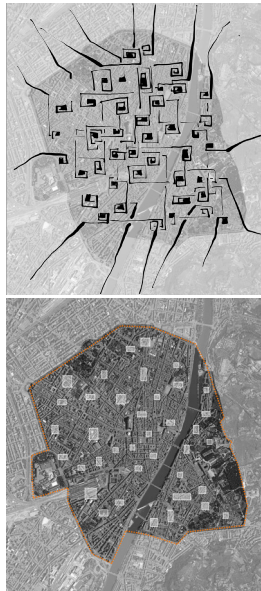
Figura 1 (a sinistra): Sistema di piazze minori nel quadrante di Sant'Ambrogio, quartiere Santa Croce a Firenze.