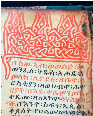
Fig. 3 GCA-004, fol. 32vb.