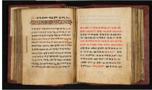
Fig. 2 MNC-009, fols 57v–58r.