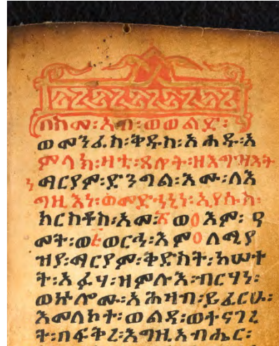
Fig. 4 GCA-010, fol. 30r.