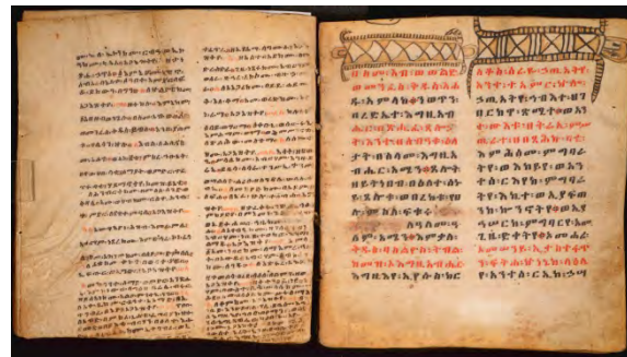
Fig. 3 BGV-003, fols 3v–4r.