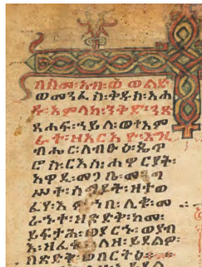
Fig. 6 MNC-020, fol. 49va.