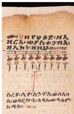
Fig. 5 MNC-020, fol. 49b.