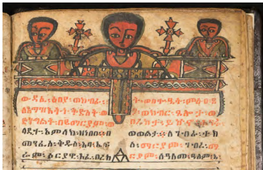
Fig. 3 MNC-015, fol. 115r.