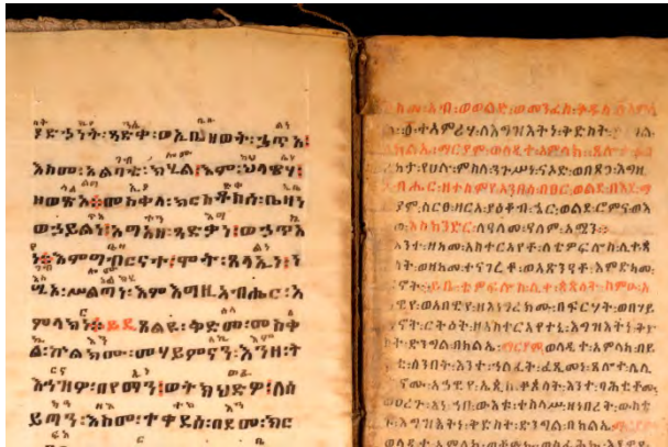
Fig. 1 BGV-001, fols 8vb–9ra.