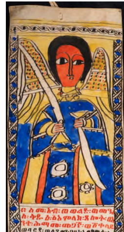
Fig. 5 BGV-011.