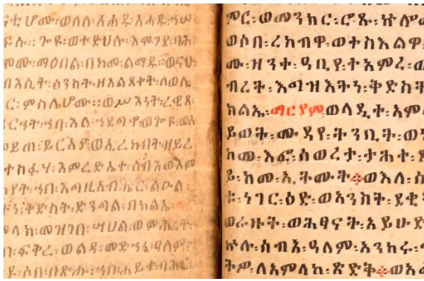
Fig. 2 BGV-001, fols 113vb–114ra.