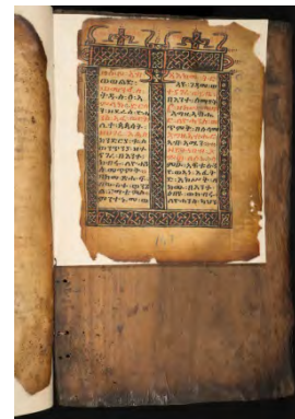
Fig. 7 MNC-020, fol. 147r.