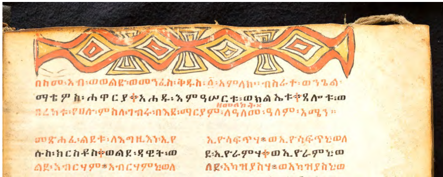
Fig. 2 GCA-001, fol. 11r.