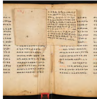
Fig. 4 MNC-016, fol. 107ar.