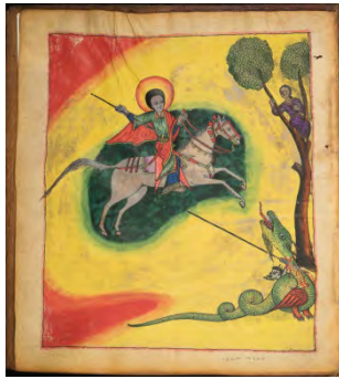
Fig. 1 MNC-001, fol. 1v.