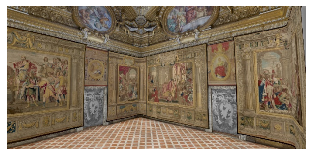
Figure 6: Reconstruction of the arrangement of the tapestries in the Sala di Saturno . The door on the left side is now covered by modern tapestry.

Given the constraints of the doors and windows and assuming that the tapestries were placed according to the chronological order of the Cosimo's life, the only possible layout is that the door to the Grand Duke's bedroom (currently hidden by a modern tapestry) should be opened and, on the other hand, the door that now leads to the next room (the Sala dell'Iliade , not yet completed in those years) had to be covered by the tapestries (Fig. 6).