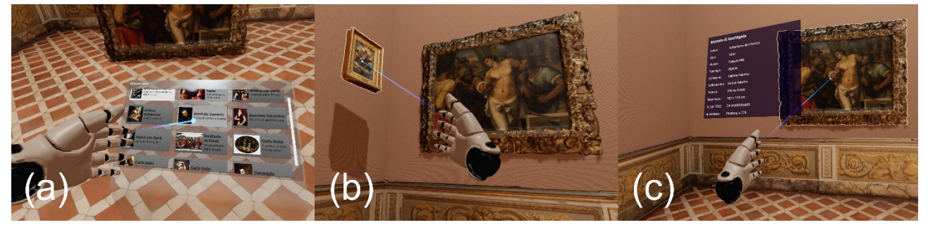
Figure 9: Some examples of the use of the virtual reality solution for museums and exhibitions. Selection of a work from a catalogue (a), arrangement of a painting on a wall (b), consultation of inventory data (c).

on the walls of the exhibition room. Therefore, the curator can study different layouts in real-time and record the various results (Fig. 9). There is also a "time machine" function for displaying how the layout of the works of art is changed over time.