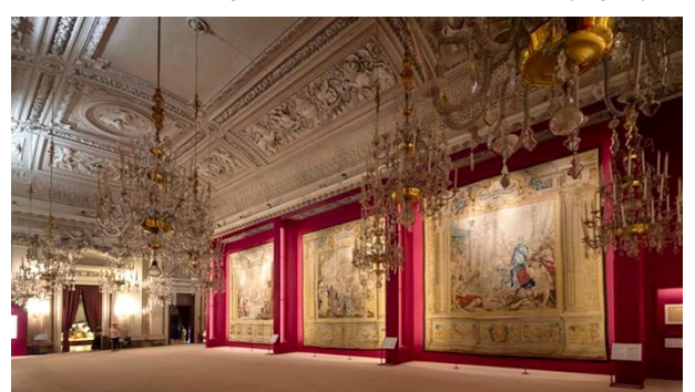
Figure 2: The tapestries dedicated to Cosimo I exhibited in the Sala Bianca of Pitti Palace.

La Sala di Saturno is currently part of the Palatine Galleries and it would not have been possible to remove the paintings that are housed there for a temporary exhibition, which was therefore set up in the Sala Bianca. This is a very large room, and the tapestries could be comfortably admired by a large audience, but visitors lost the feeling of the context for which they were designed, so much so that the majestic tapestries appeared even larger than the Sala di Saturno (Fig. 2).