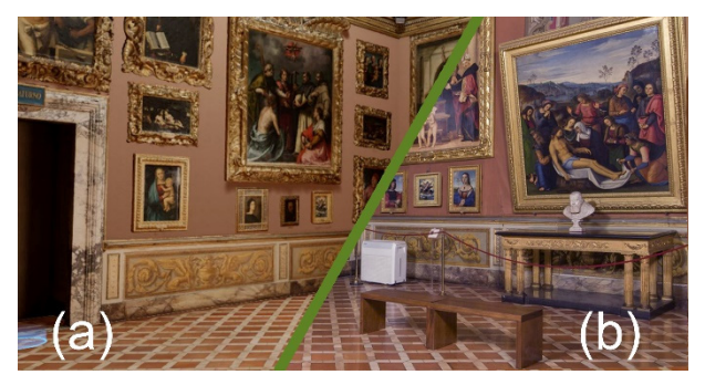
Figure 8: A comparison between the actual Sala di Saturno (a) and the VR model (b).

By imagining the use of a curator, 3D models of the paintings currently on display in the Sala di Saturno were also created. For smooth interaction, all 3D models with a high number of polygons (high poly) were converted applying retopology and texture baking techniques into models with a low number of polygons (low poly) but maintaining a high visual quality (Fig. 8).