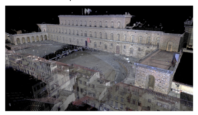
Figure 1 : General view of the main façade of Pitti Palace (point cloud obtained by laser scanner survey).

Pitti Palace is the largest palace in Florence (Fig. 1) and was one of the great Italian royal palaces, inhabited by the dynasties of the Grand Dukes of Tuscany (Medici and Hapsburg-Lorraine) and, after the unification of Italy, by the Savoia royal family for five years (Bertelli, 2002). It currently houses four museums that are part of the Uffizi Galleries complex.