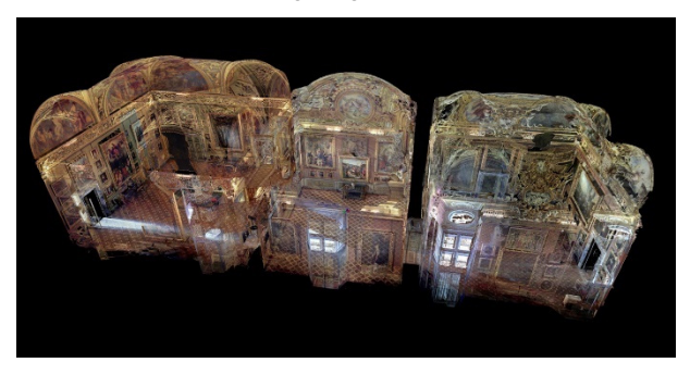
Figure 3 : Laser scanner survey of the Sala di Saturno (n the middle), between the Sala di Giove (on the right) and the Sala dell'Iliade (on the left).

The laser scanner survey was performed with a Z+F 5010C scanner, also acquiring RGB values. Considering the complex geometry of the room and especially the vault, which has highly three-dimensional decorations, six scans were done in the hall (one in the centre, four in the corners and one in the splay of the window) and another two in the adjacent halls to show the relationship with the surrounding rooms (Fig. 3). For the best visual quality, scans were carried out under different conditions of natural and artificial lighting.