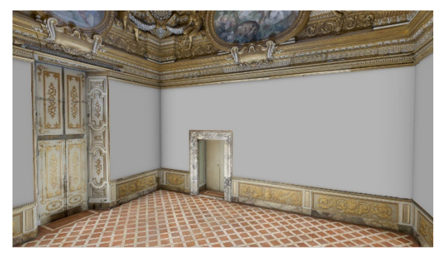
Figure 5 : Reconstruction of the layout of the Sala di Saturno before its conversion into a picture gallery, used to study the disposition of the tapestries in the 17<sup>th</sup> century.

Starting from the 3D model of the current state, a reconstruction of the Sala di Saturno in the 17<sup>th</sup> century was carried out, removing all the paintings and furnishings present today (Fig. 5). Real-size models of the tapestries have also been created by applying high-resolution images as textures.