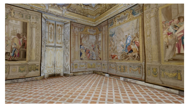
Figure 7 : An example of the tapestries overlapped and folded in the corners. On the right wall, the door that now leads to the next room is covered, because the Sala dell'Iliade was completed some years later.

Some tapestries should also be folded at some corners. A possible confirmation of this reconstruction is that in some cases the figures are divided into two groups. If the tapestries were folded, the figures seemed to be face to face, and the perspective of the scene is accentuated. Other, smaller tapestries were placed above doors and as a door covering (Fig. 7).